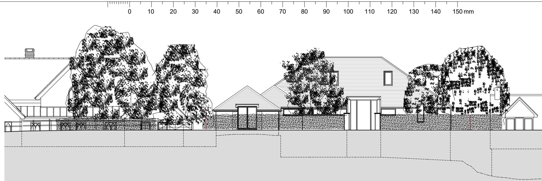
Proposed streetscene elevation 1:200