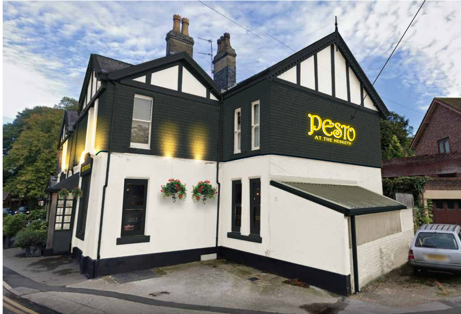
All Lighting Existing