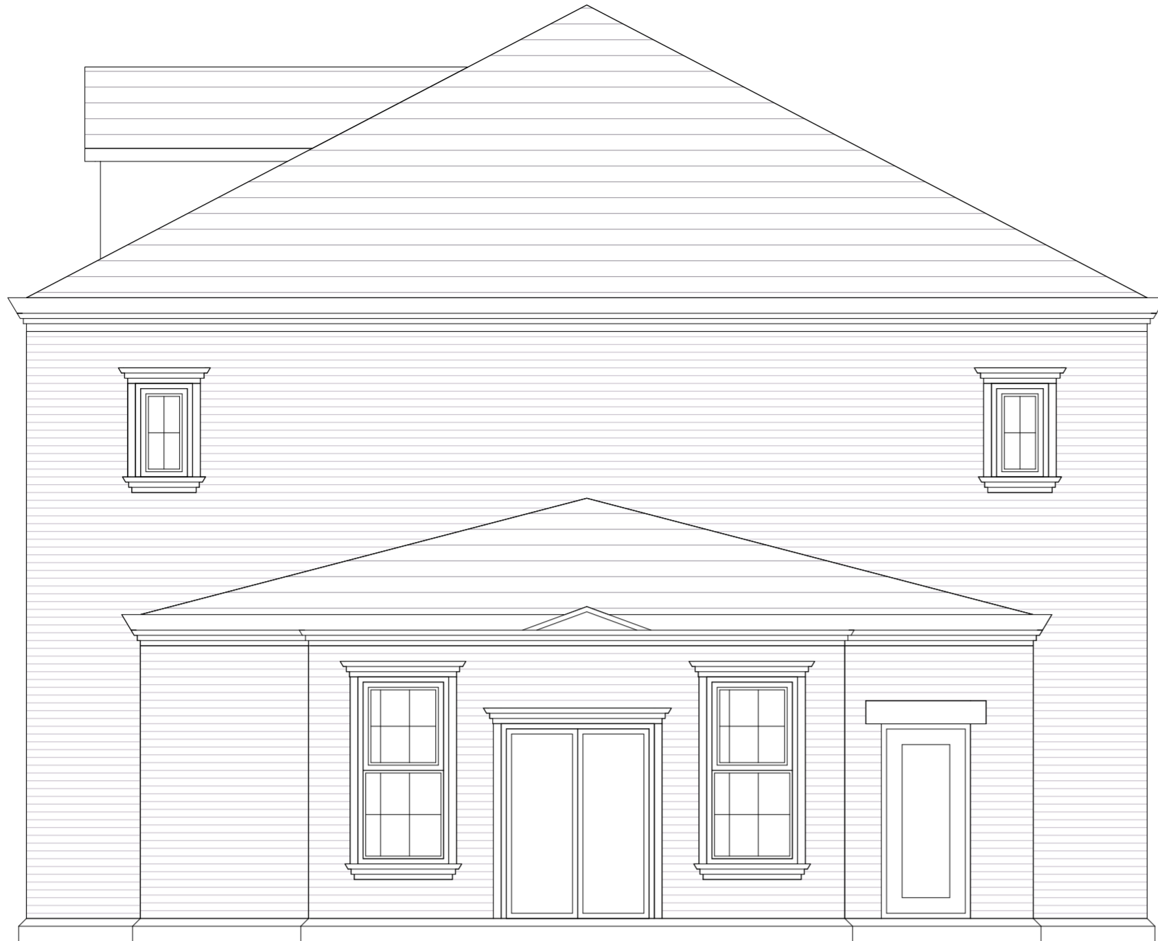
Existing Side Elevation A