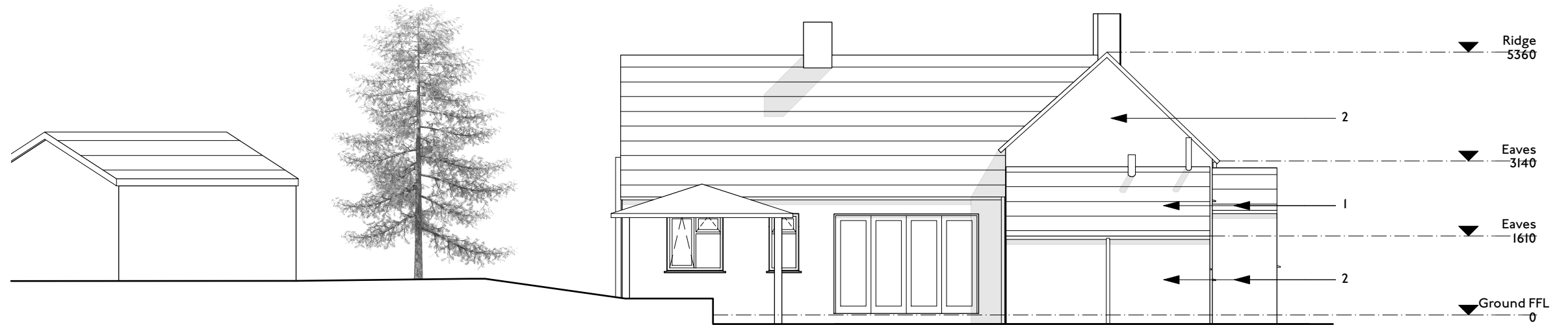
2 | 1:100 Existing South-West Elevation