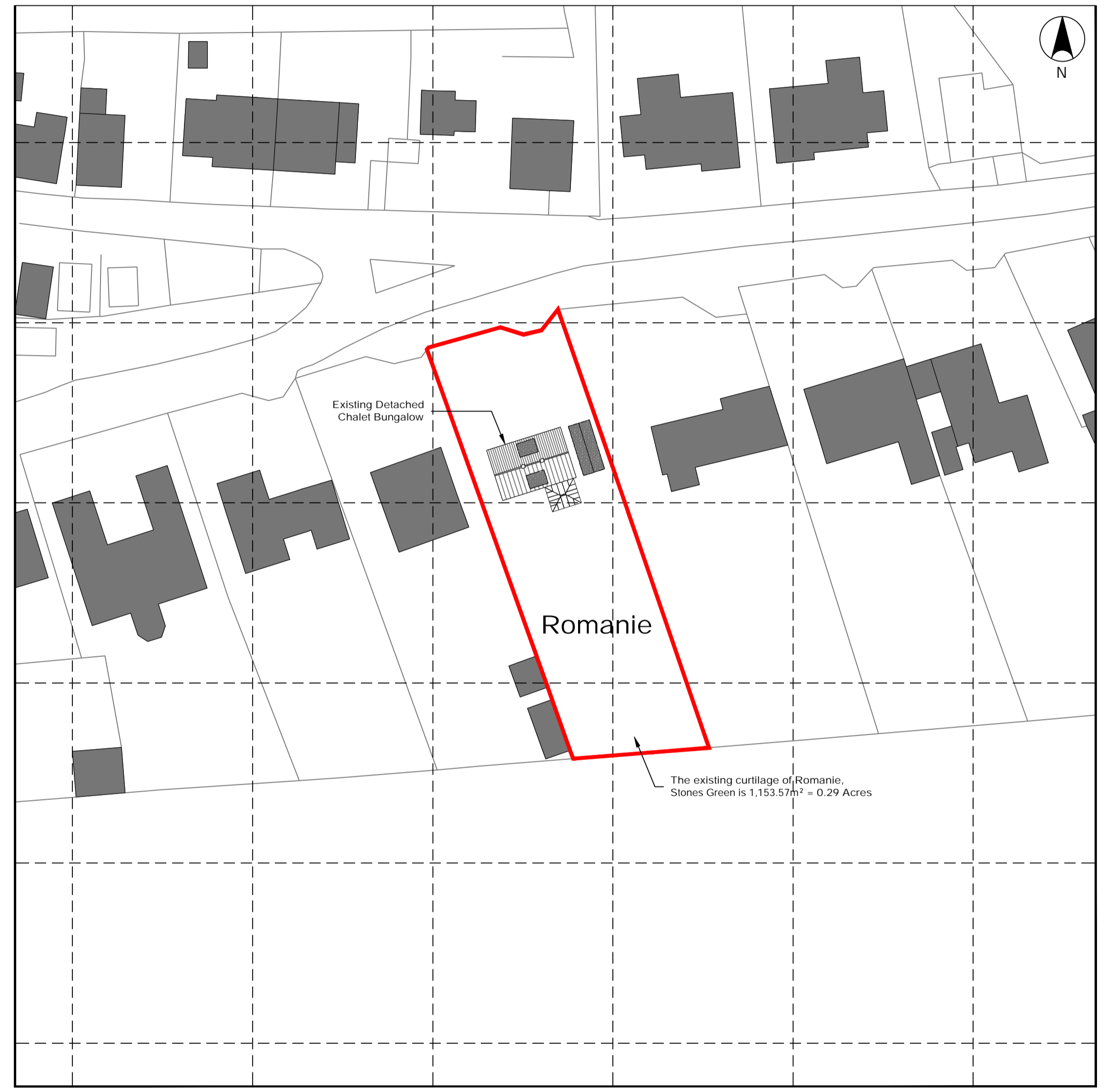
1.2 Existing Block Plan Scale 1:500 0m 10m 20m 30m 40m 50m 5m 15m 25m 35m 45m Scale 1:500 at A1 Site Location Key Indicates Boundary Line of Proposed Development Land Owned by the Applicant Indicates Boundary Line of Other Land Owned by the Applicant