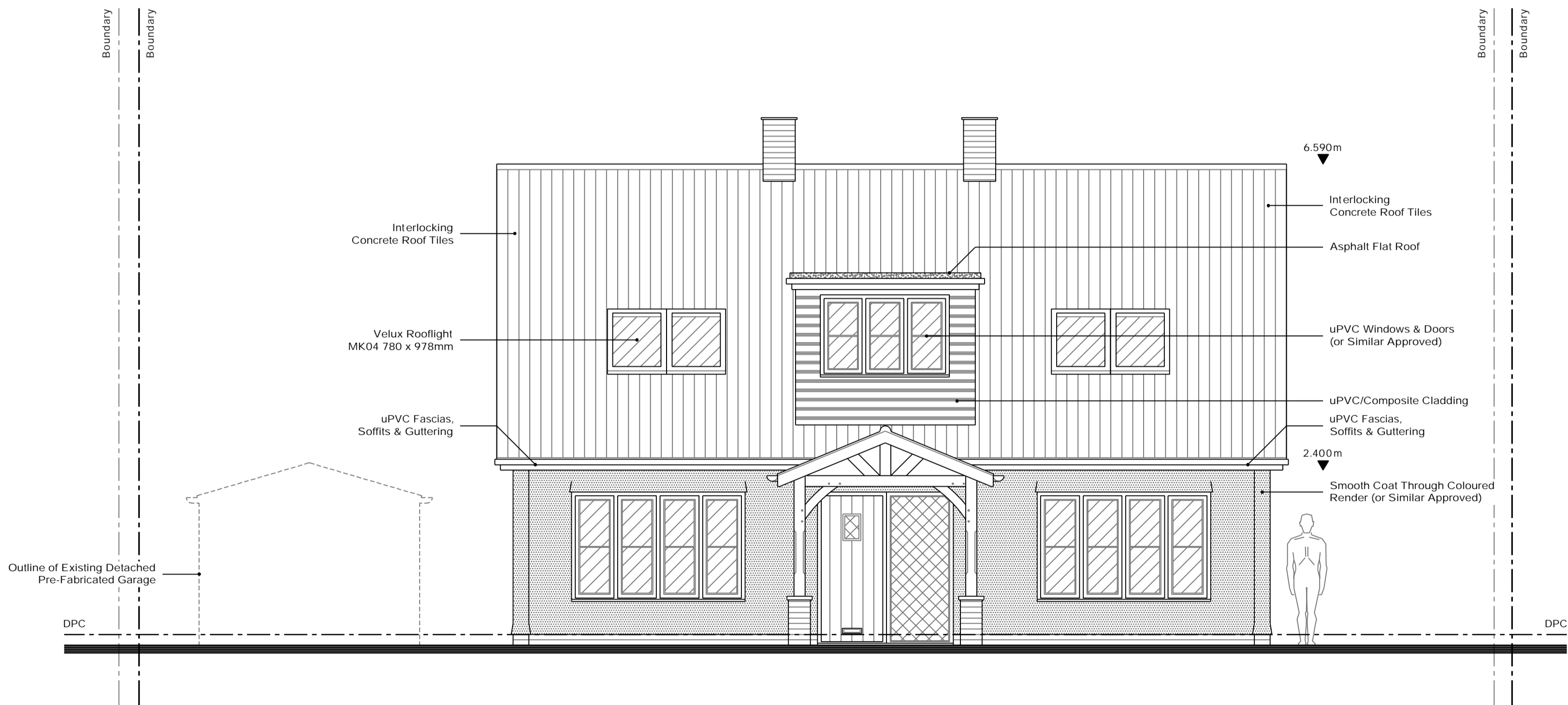
3.1 Proposed Front (South East) Elevation Scale 1:50