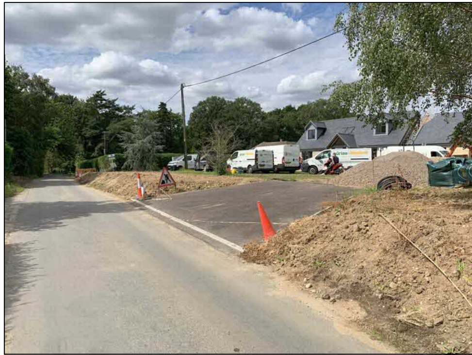
THREE ELMS: IMAGE 3 SCALE: NTS@A3