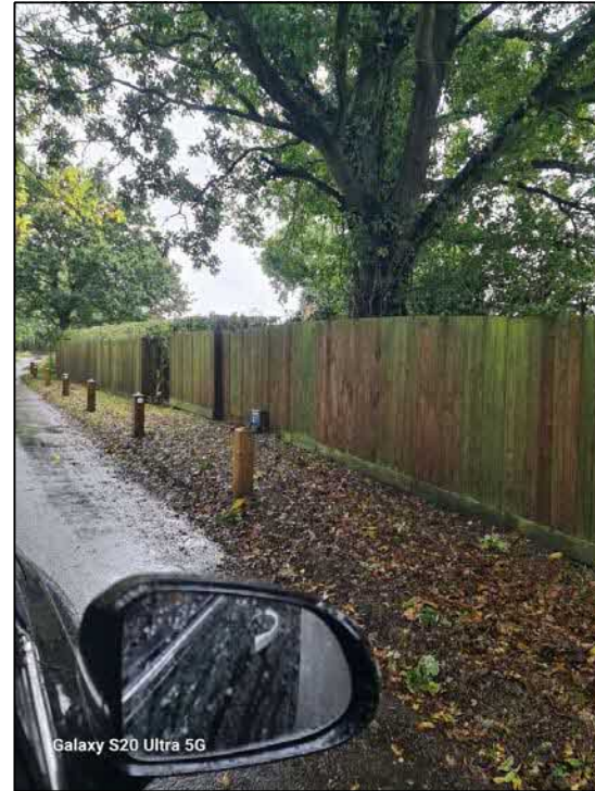
THREE ELMS: PHOTO OF SIMILAR FENCES HARTS LANE SCALE: NTS@A3