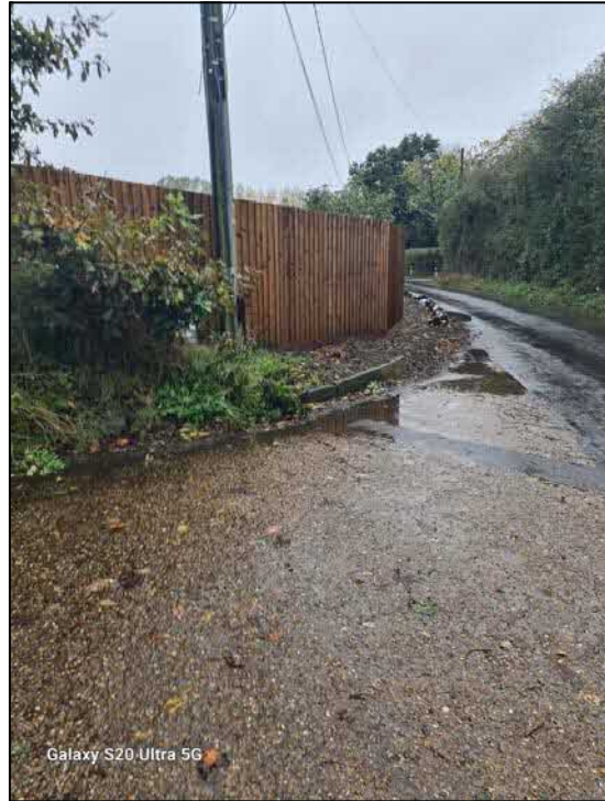
THREE ELMS: PHOTO OF SIMILAR FENCES HARTS LANE SCALE: NTS@A3