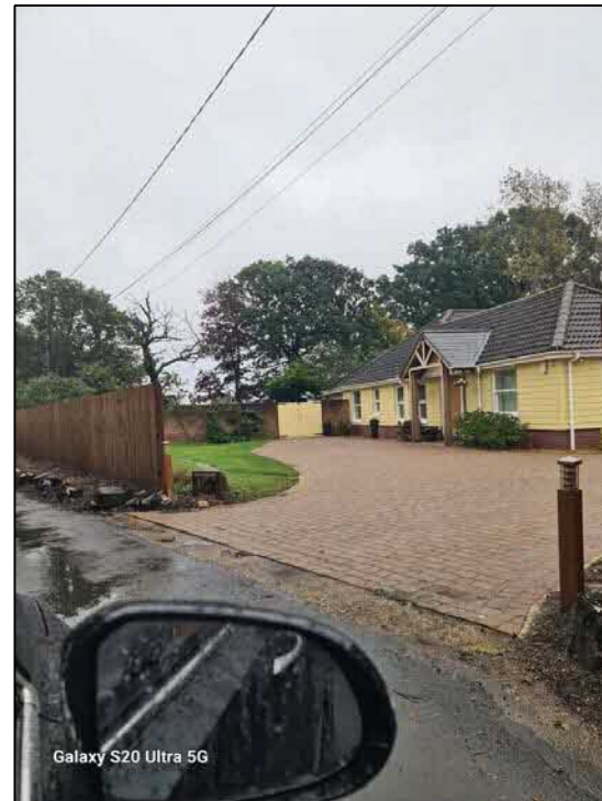
THREE ELMS: PHOTO OF SIMILAR FENCES HARTS LANE SCALE: NTS@A3