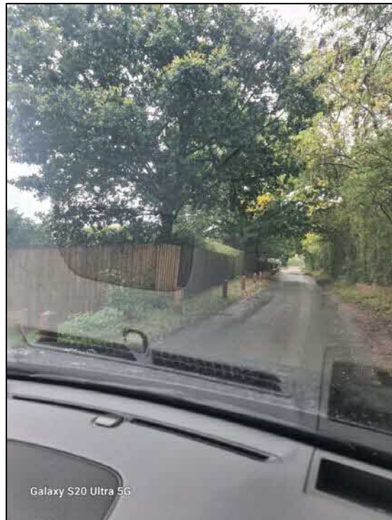
THREE ELMS: PHOTO OF SIMILAR FENCES HARTS LANE SCALE: NTS@A3