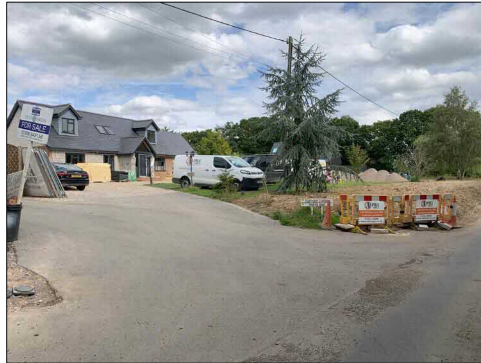
THREE ELMS: IMAGE 2 SCALE: NTS@A3