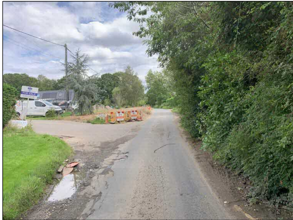
THREE ELMS: IMAGE 1 SCALE: NTS@A3