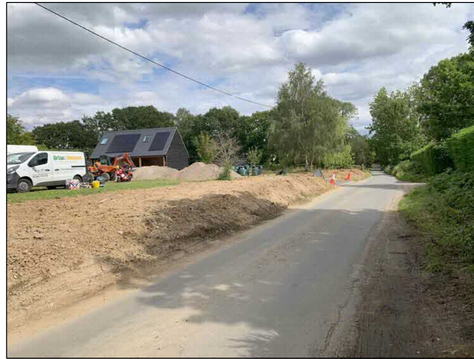
THREE ELMS: IMAGE 4 SCALE: NTS@A3