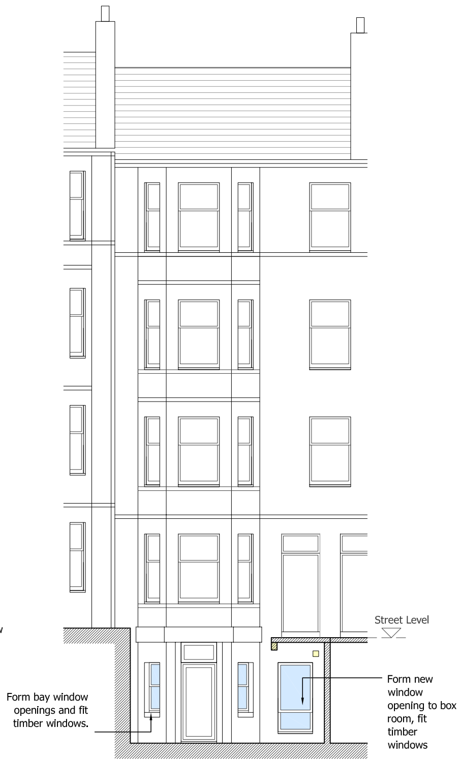
02 FRONT ELEVATION SCALE 1:100@A3