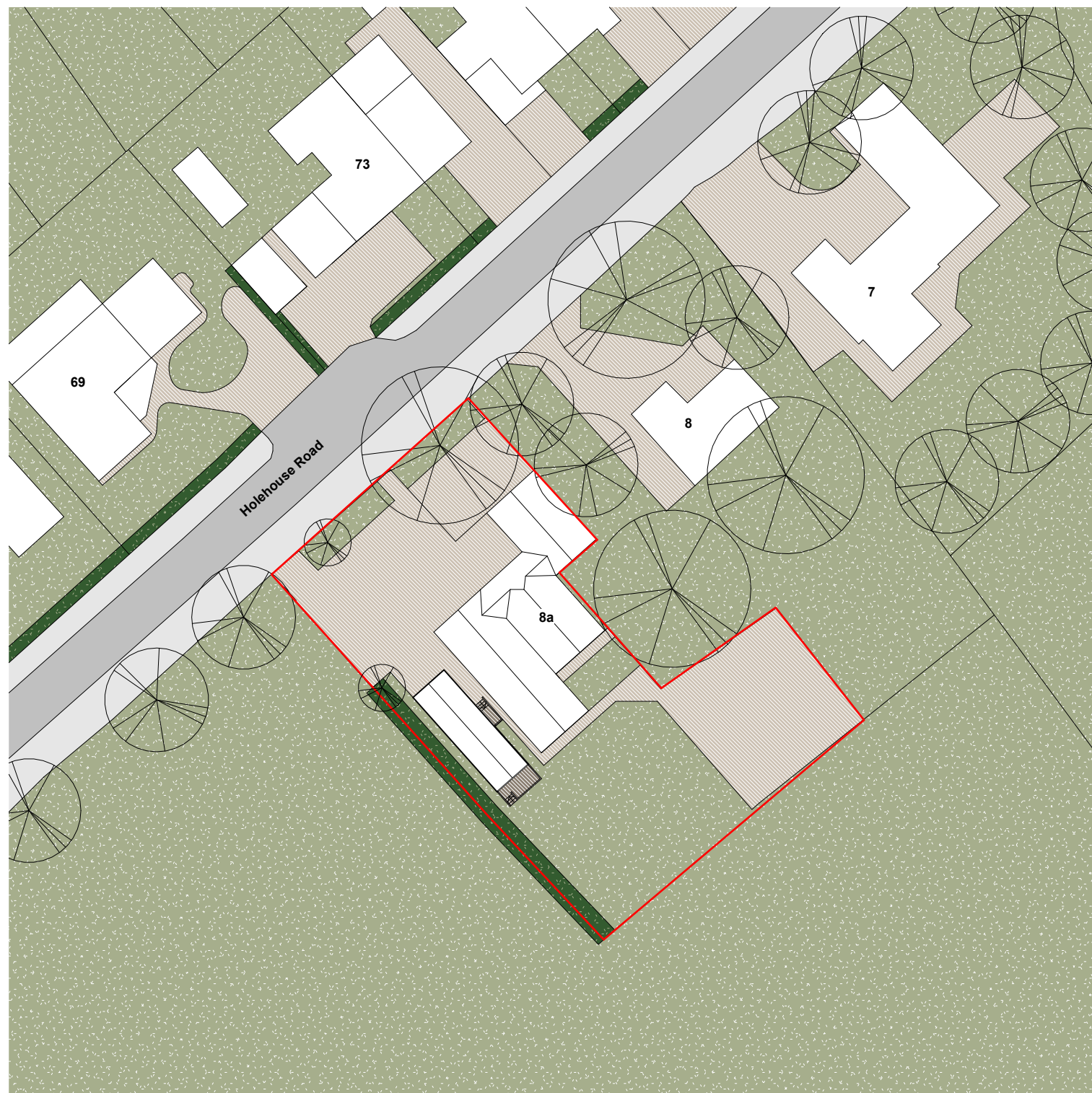
Scale 1:500 Proposed Site Plan

FOR ELECTRONIC DATA ISSUE Electronic Data / drawings are issued as "read only" and should not be interrogated for measurement. All dimensions and levels should read, only from those values stated in text on the drawing.