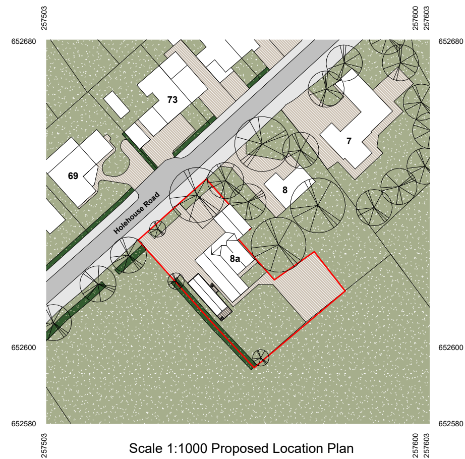
Scale 1:1000 Proposed Location Plan