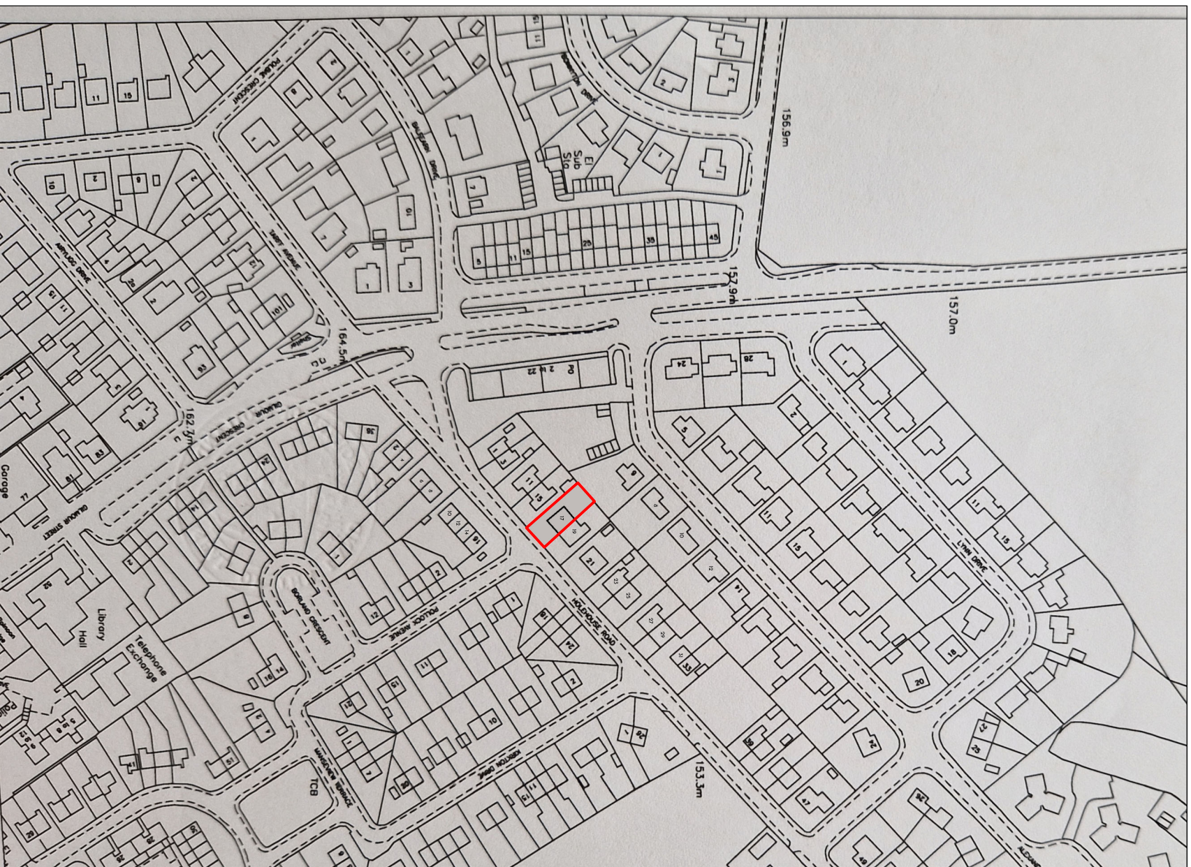
Proposed Location Plan Scale 1:2500