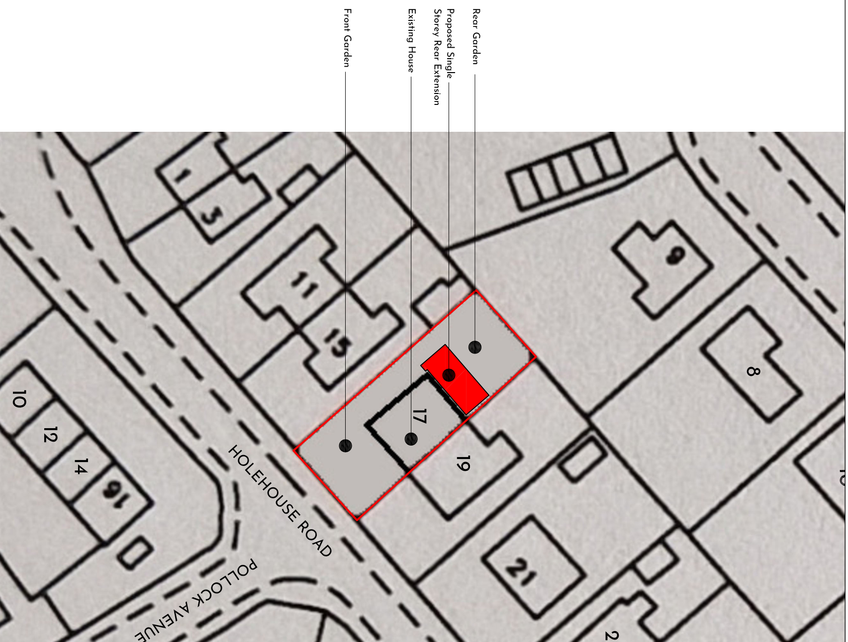
Proposed Block Plan Scale 1:500

NOTES: Drawings to be read in conjunction with Structural Engineers Drawings and Specifications.