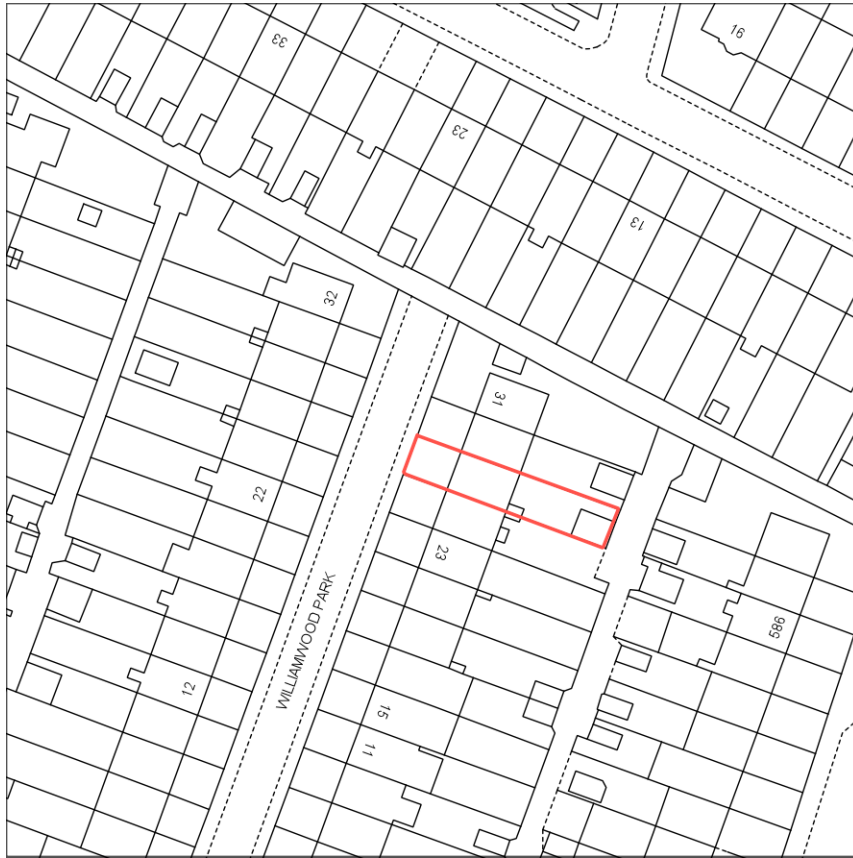
27, Williamwood Park, Glasgow