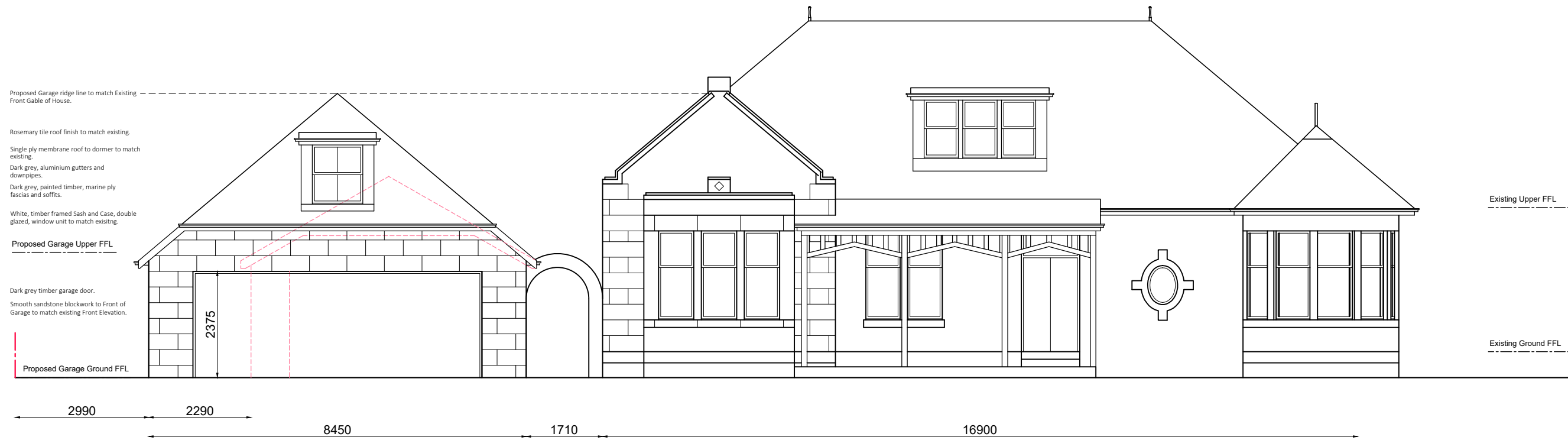
North (Front) Elevation as Proposed @ 1:100