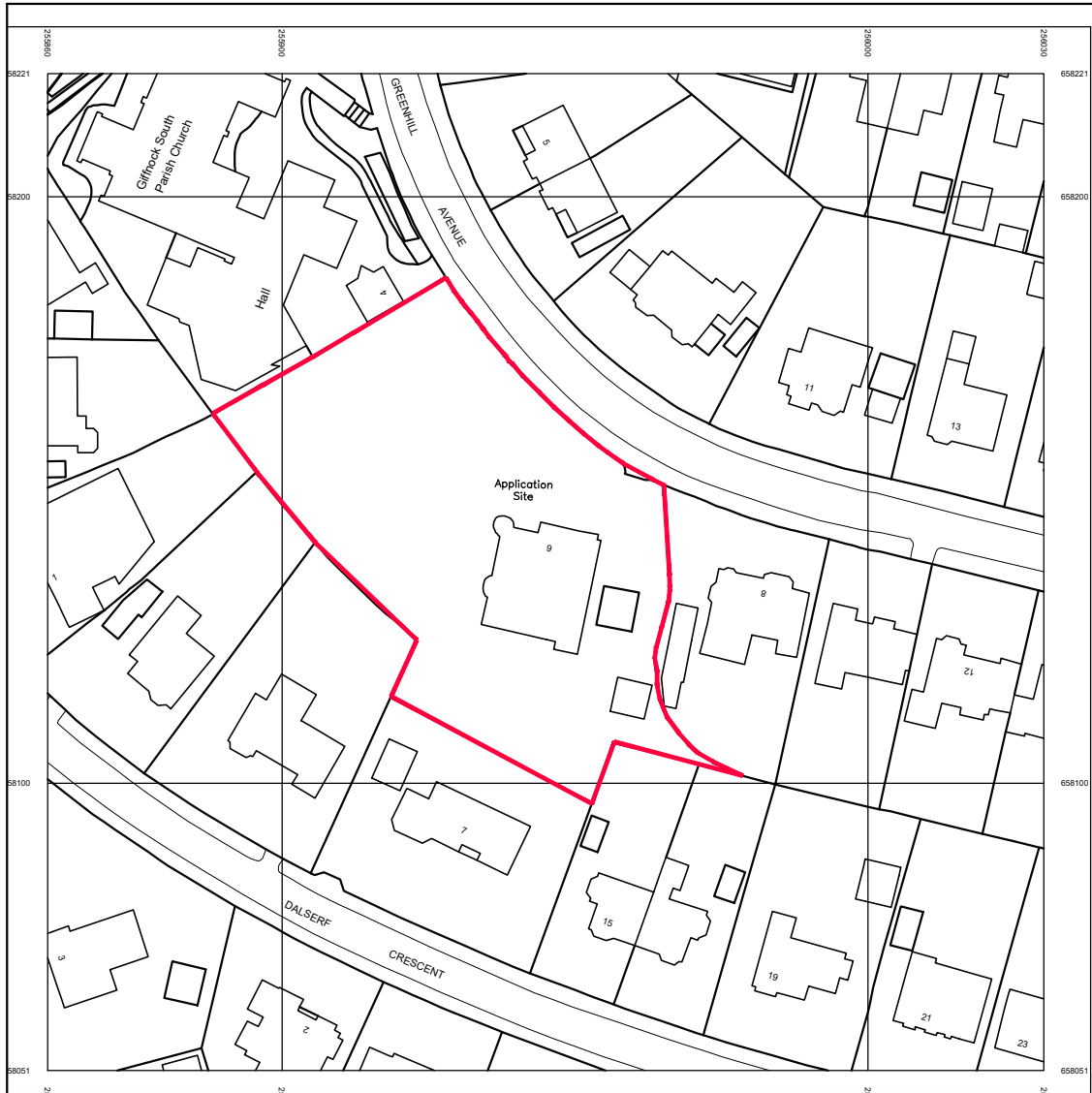
Location Plan as Existing @ 1:1250