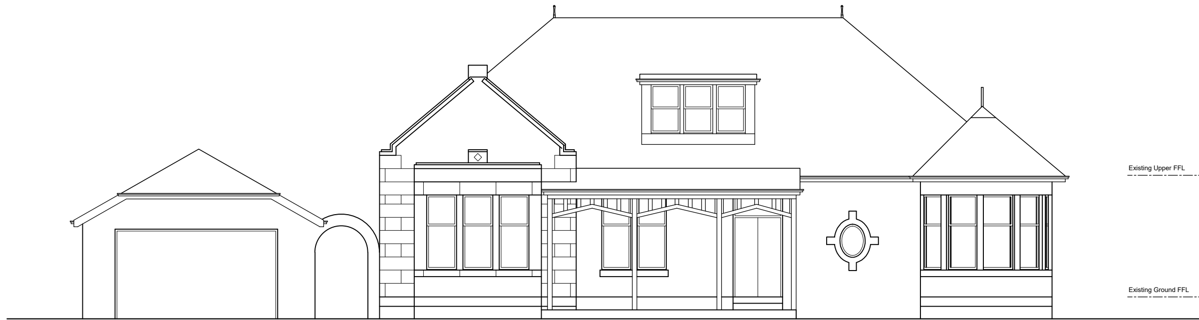
North (Front) Elevation as Approved @ 1:100