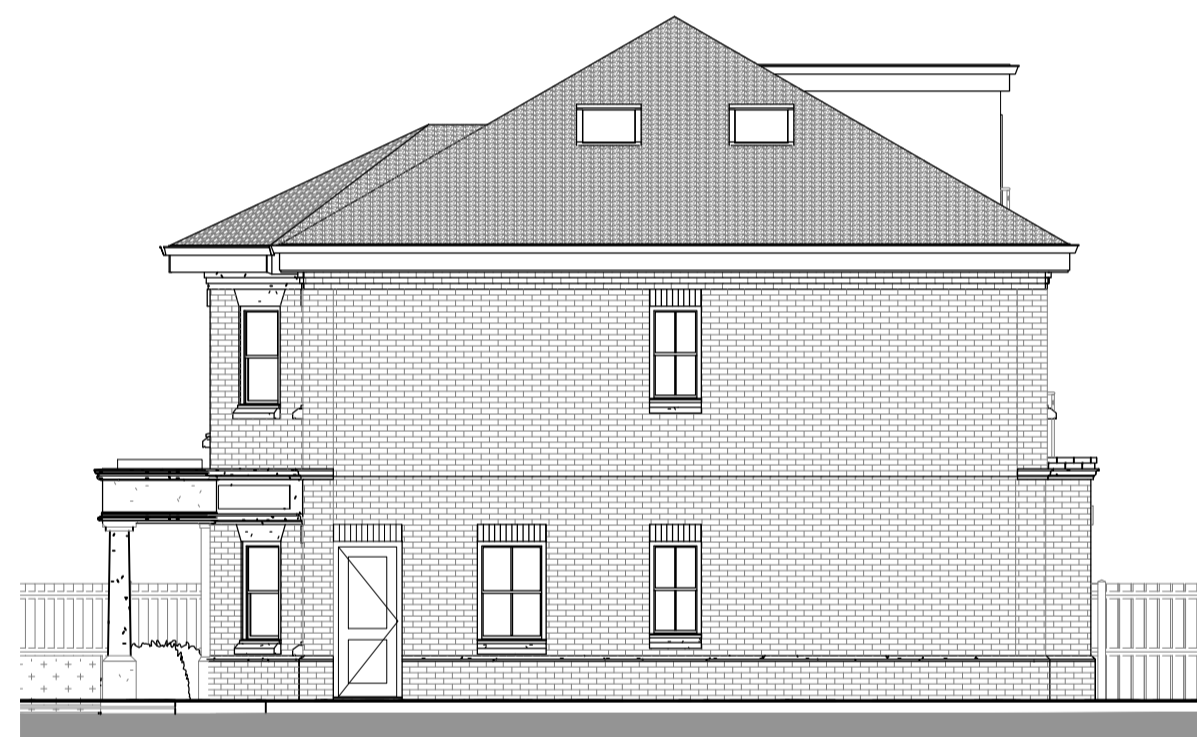
4 Proposed east side elevation 1 : 100