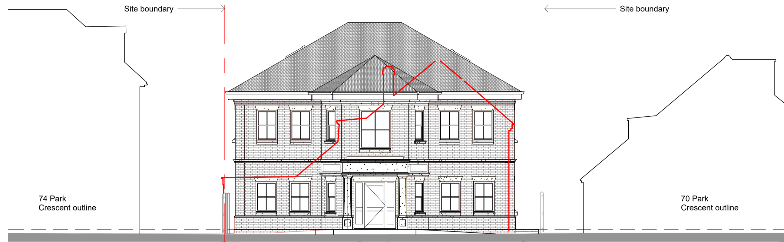
1 Proposed front elevation 1 : 100