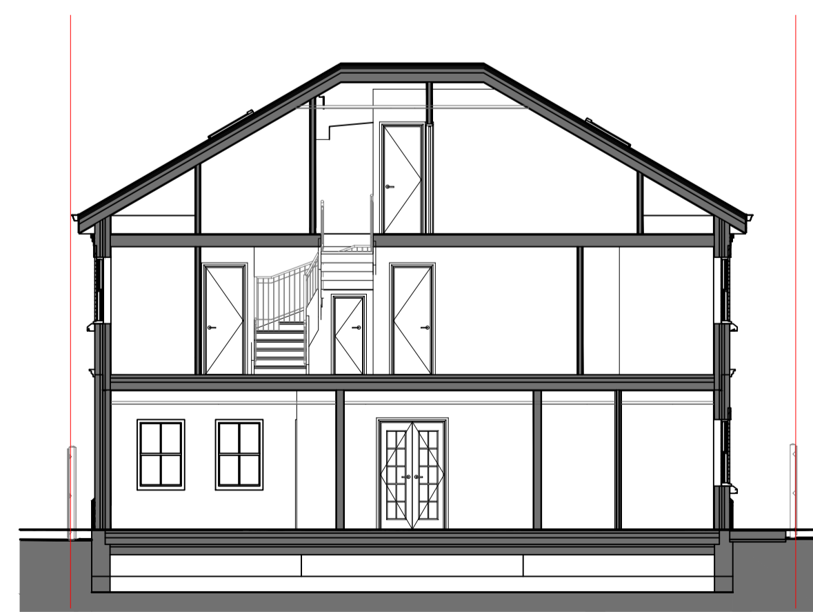
5 Proposed section AA 1 : 100