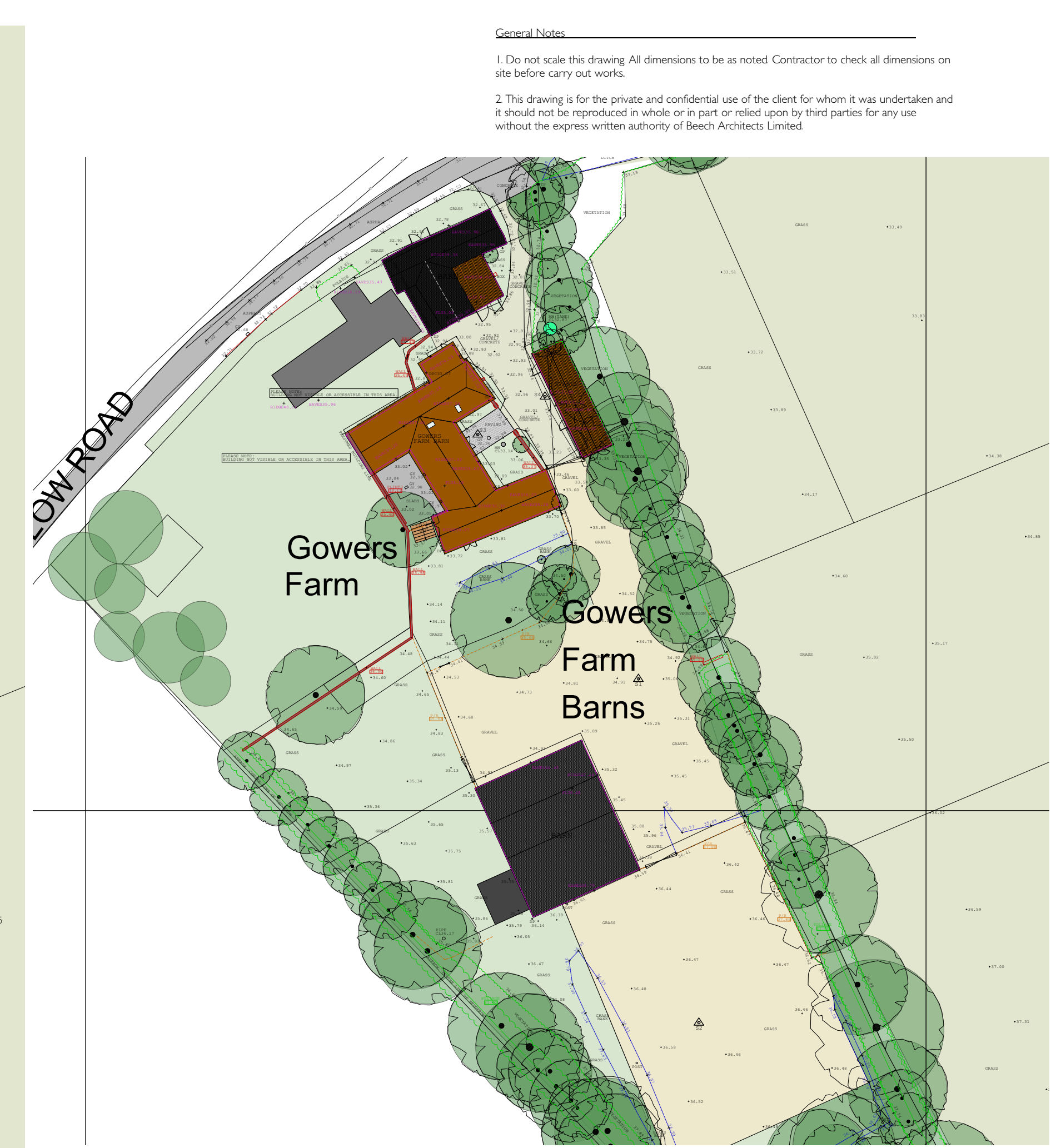
BLOCK PLAN SCALE: 1:500

General Notes: 1. Do not scale this drawing. All dimensions to be noted. Contractor to check all dimensions on site before carry out works. 2. This drawing is for the private and confidential use of the client for whom it was undertaken and it should not be reproduced in whole or in part or relied upon by third parties for any use without the express written authority of Beech Architects Limited.