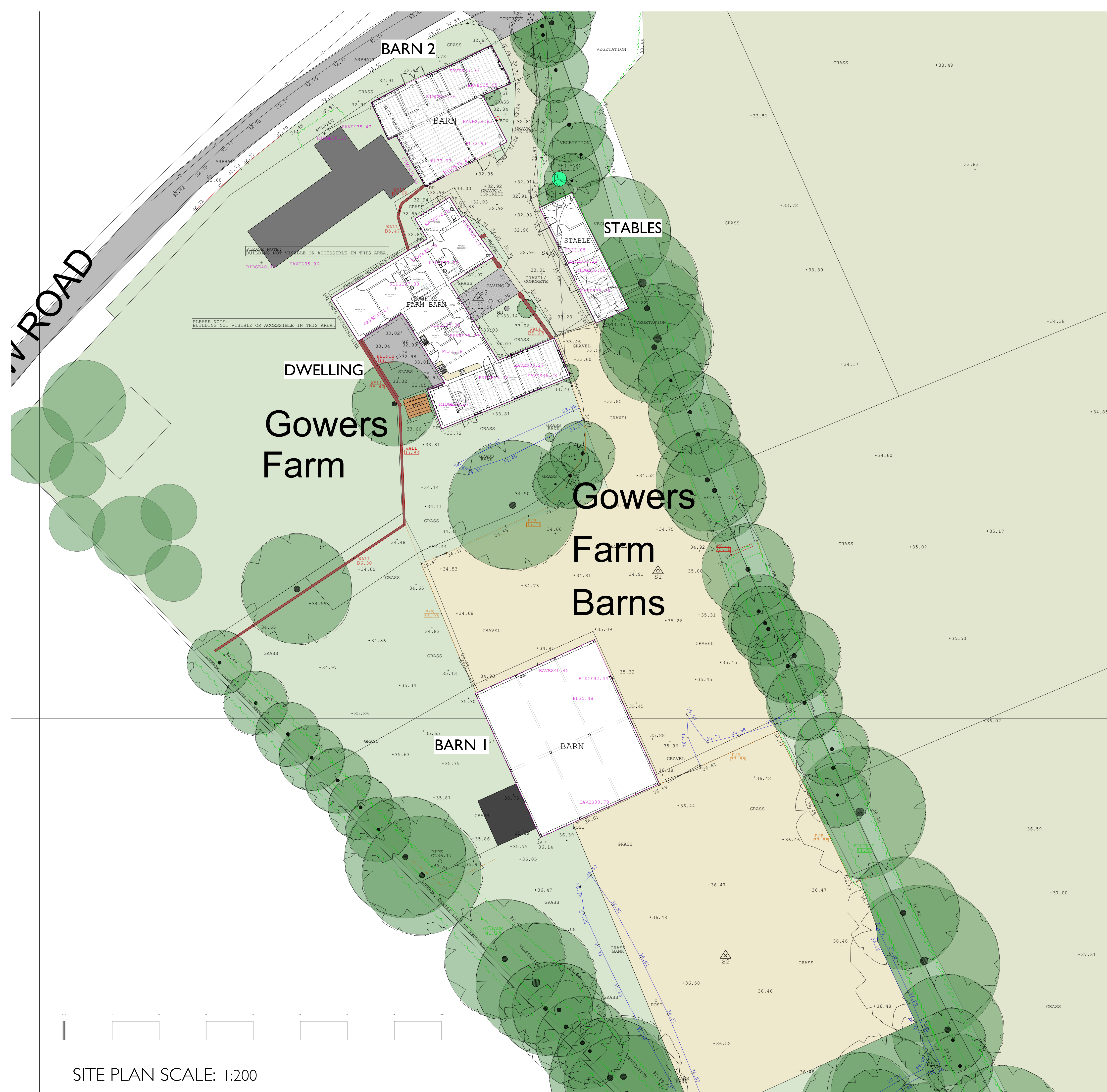
SITE PLAN SCALE: 1:200