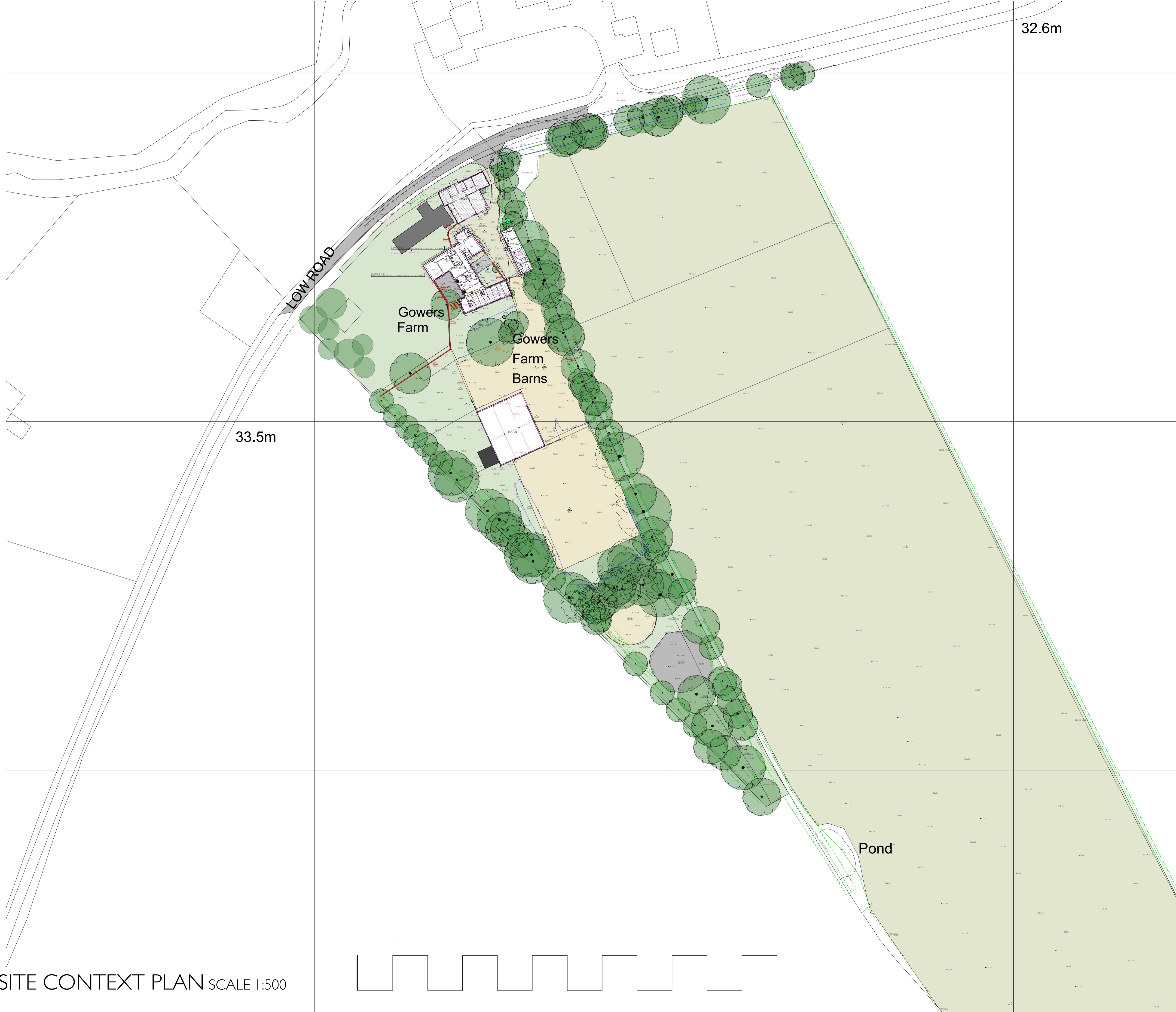
SITE CONTEXT PLAN SCALE 1:500

General Notes 1. Do not scale this drawing. All dimensions to be as noted. Contractor to check all dimensions on site before carry out works. 2. This drawing is for the private and confidential use of the client for whom it was undertaken and it should not be reproduced in whole or in part or relied upon by third parties for any use without the express written authority of Beech Architects Limited.