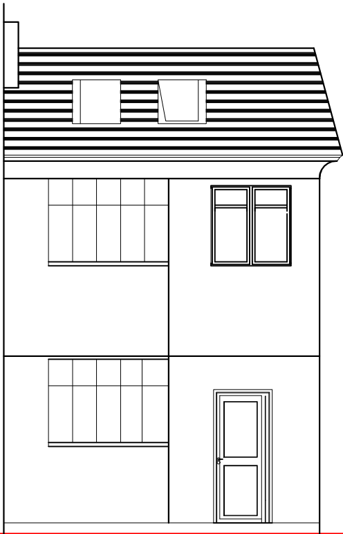
FRONT ELEVATION (Existing)