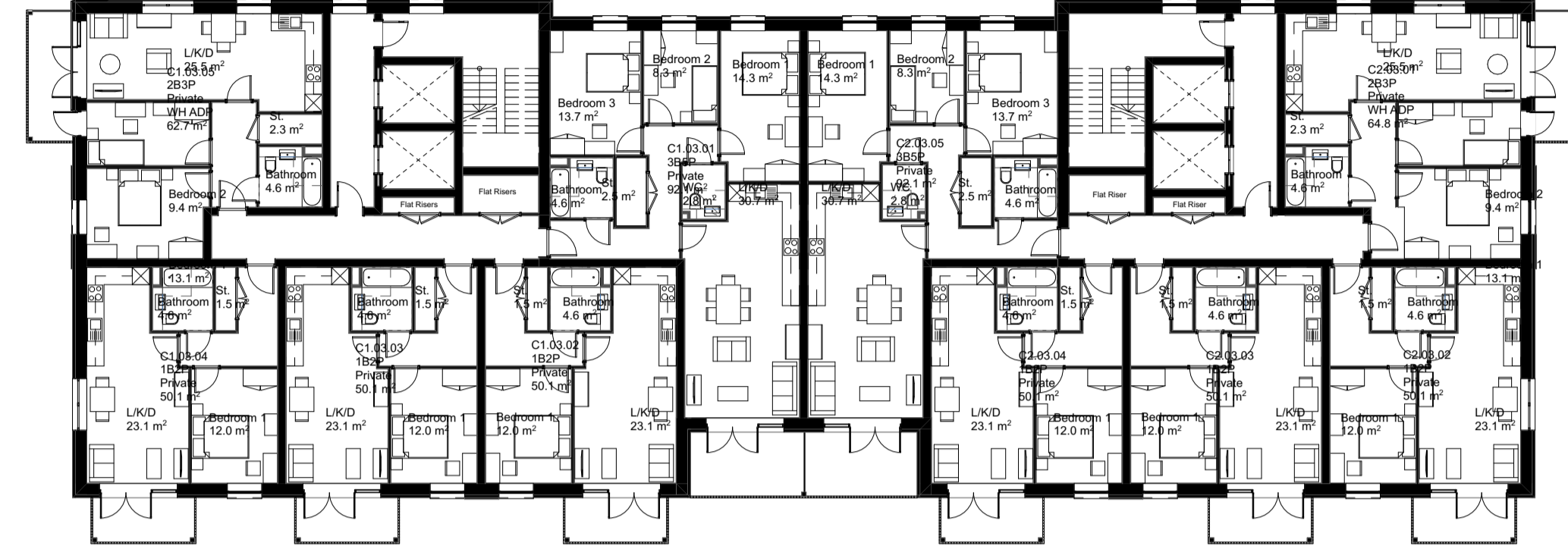
03 Third Floor