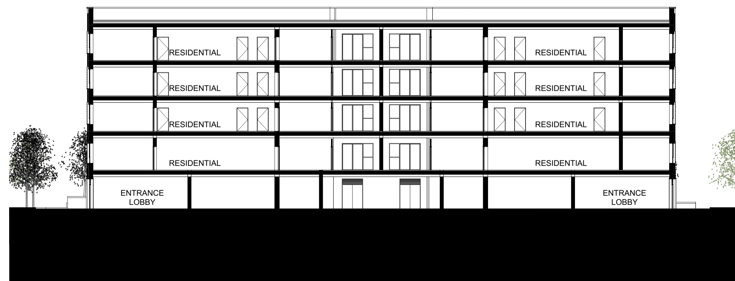
Block C Section aa 1:200