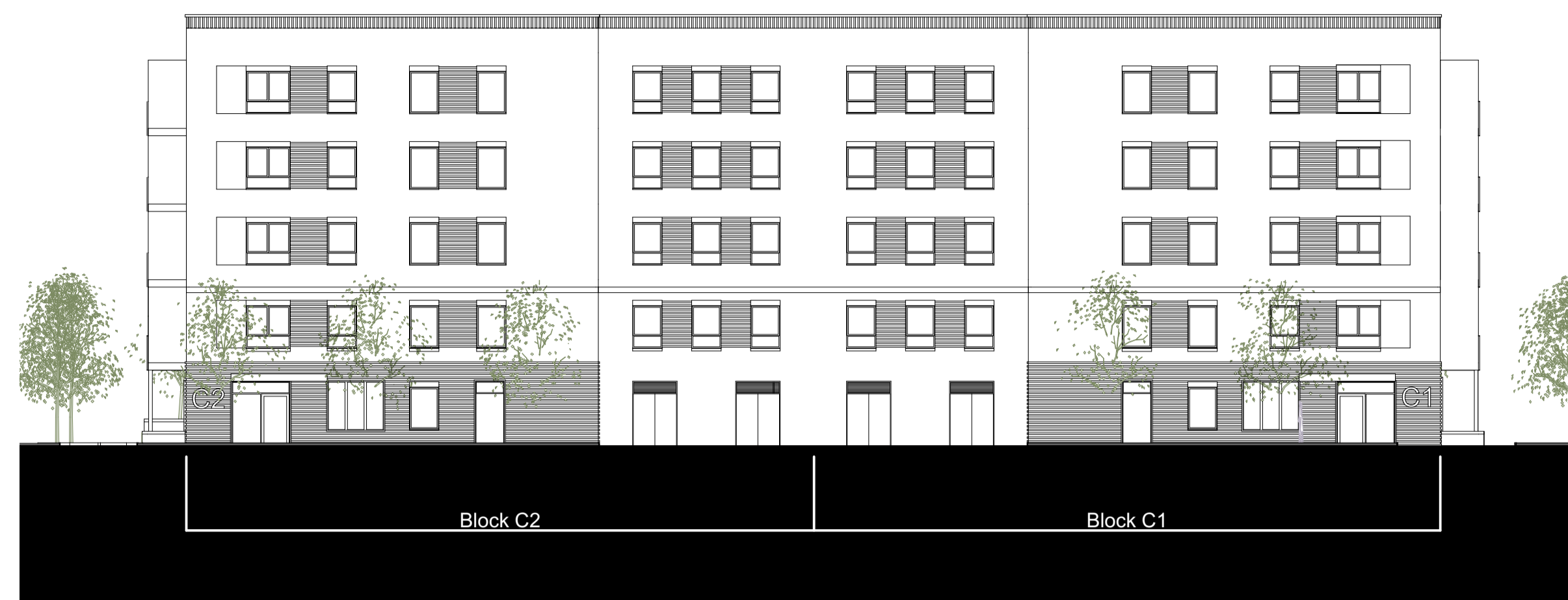
Block C North Elevation (facing Yarnton Way) 1:200