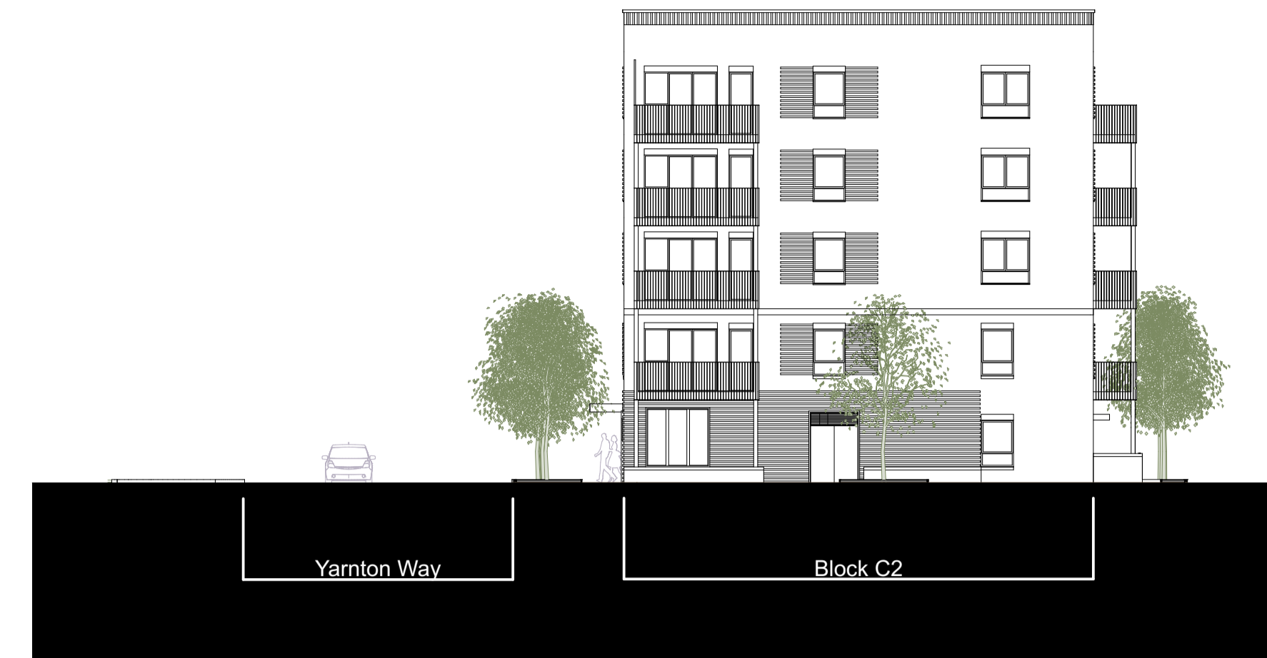
Block C East Elevation 1:200