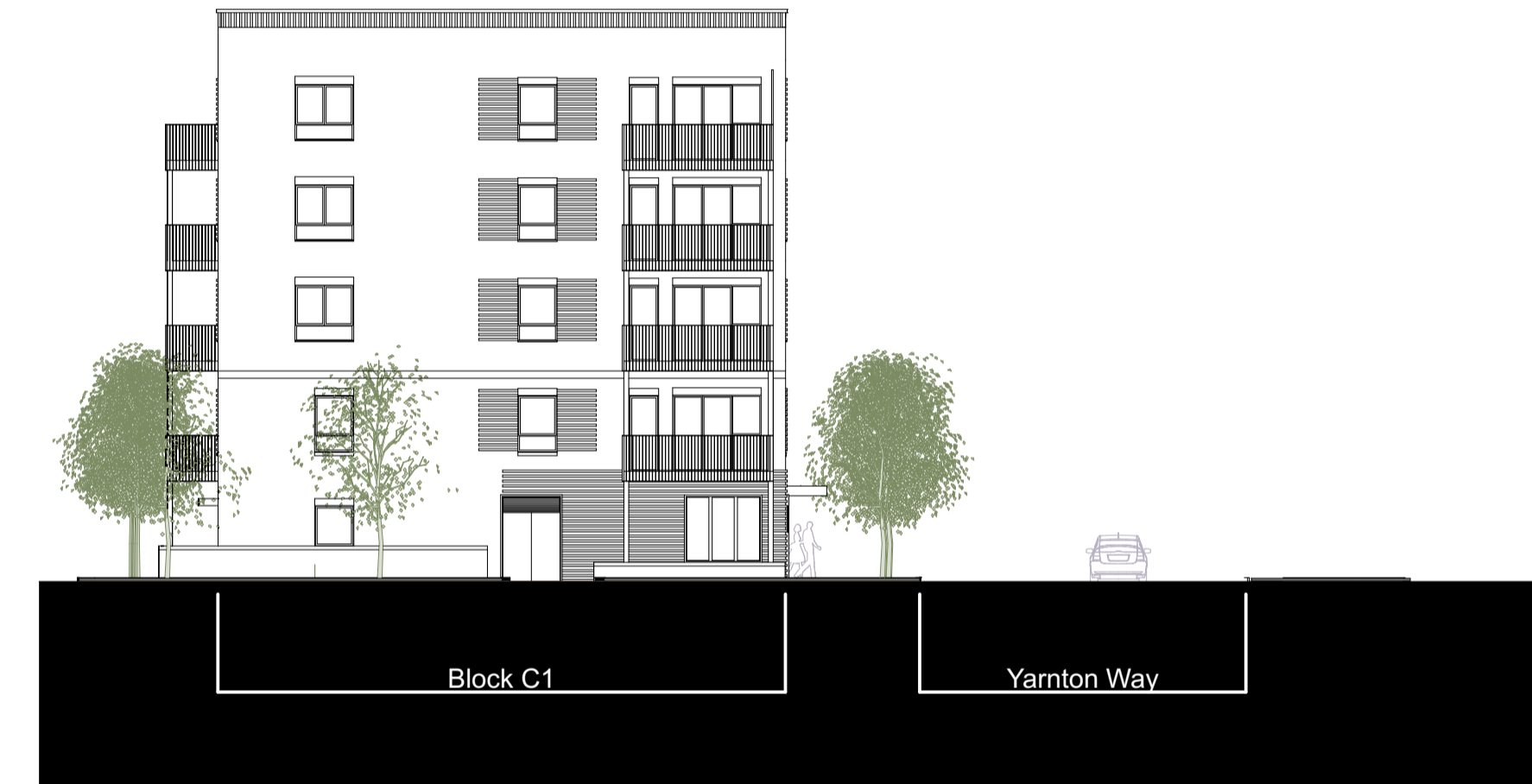
Block C West Elevation 1:200