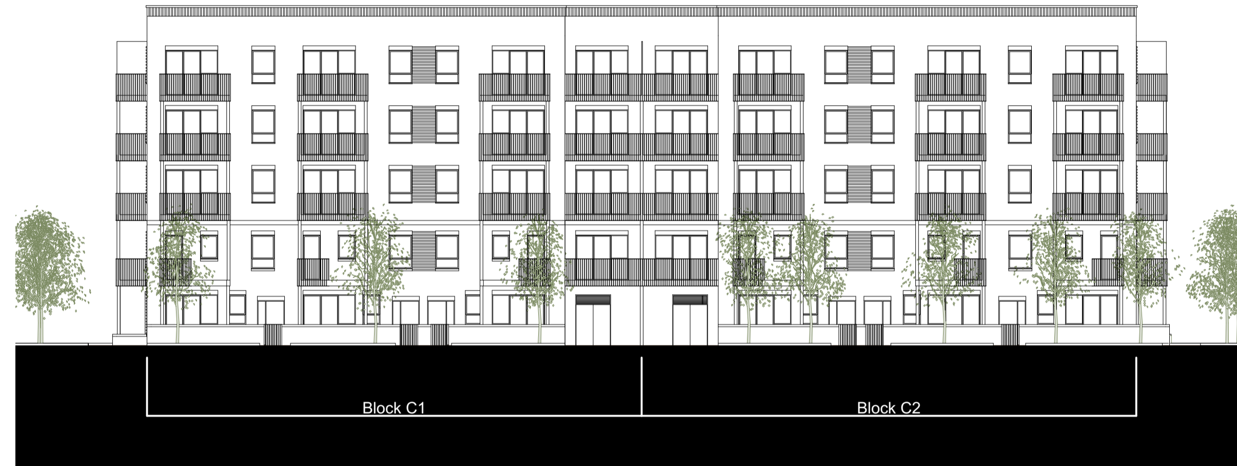
Block C South Elevation 1:200