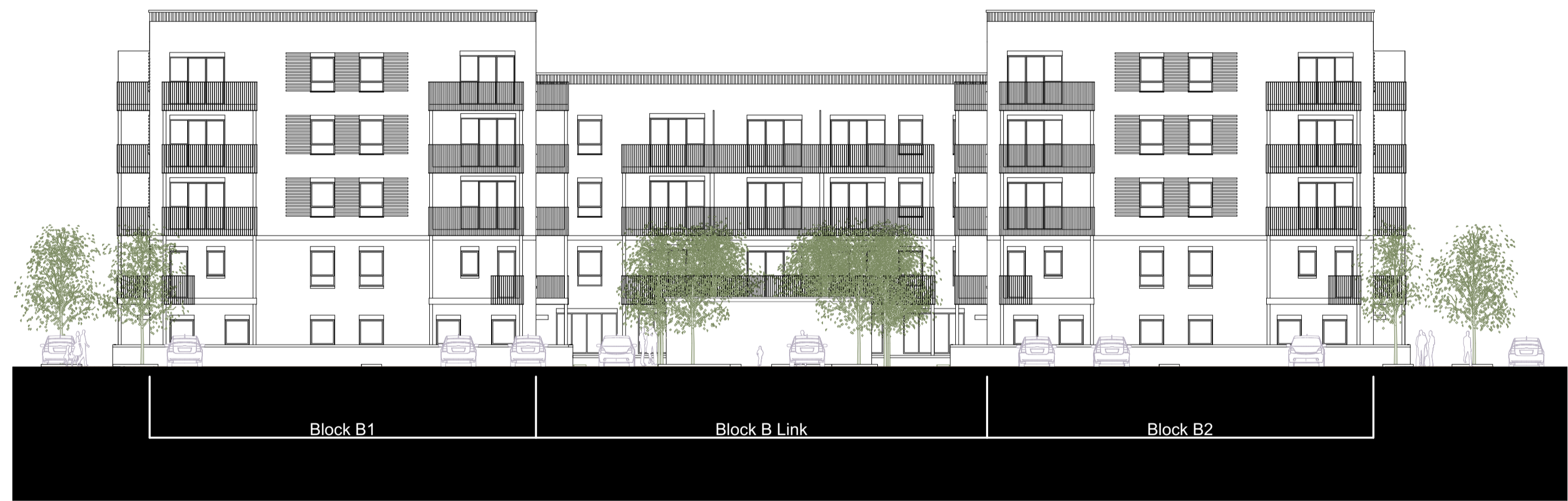
Block B South Elevation 1:200