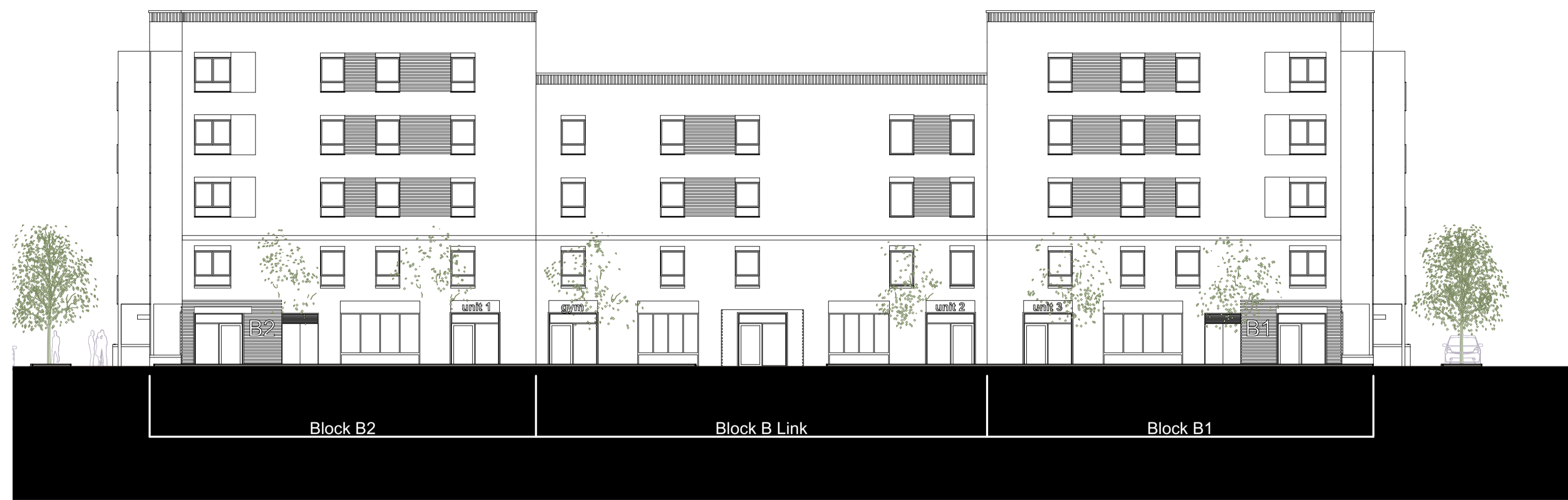
Block B North Elevation (Facing Yarnton Way) 1:200