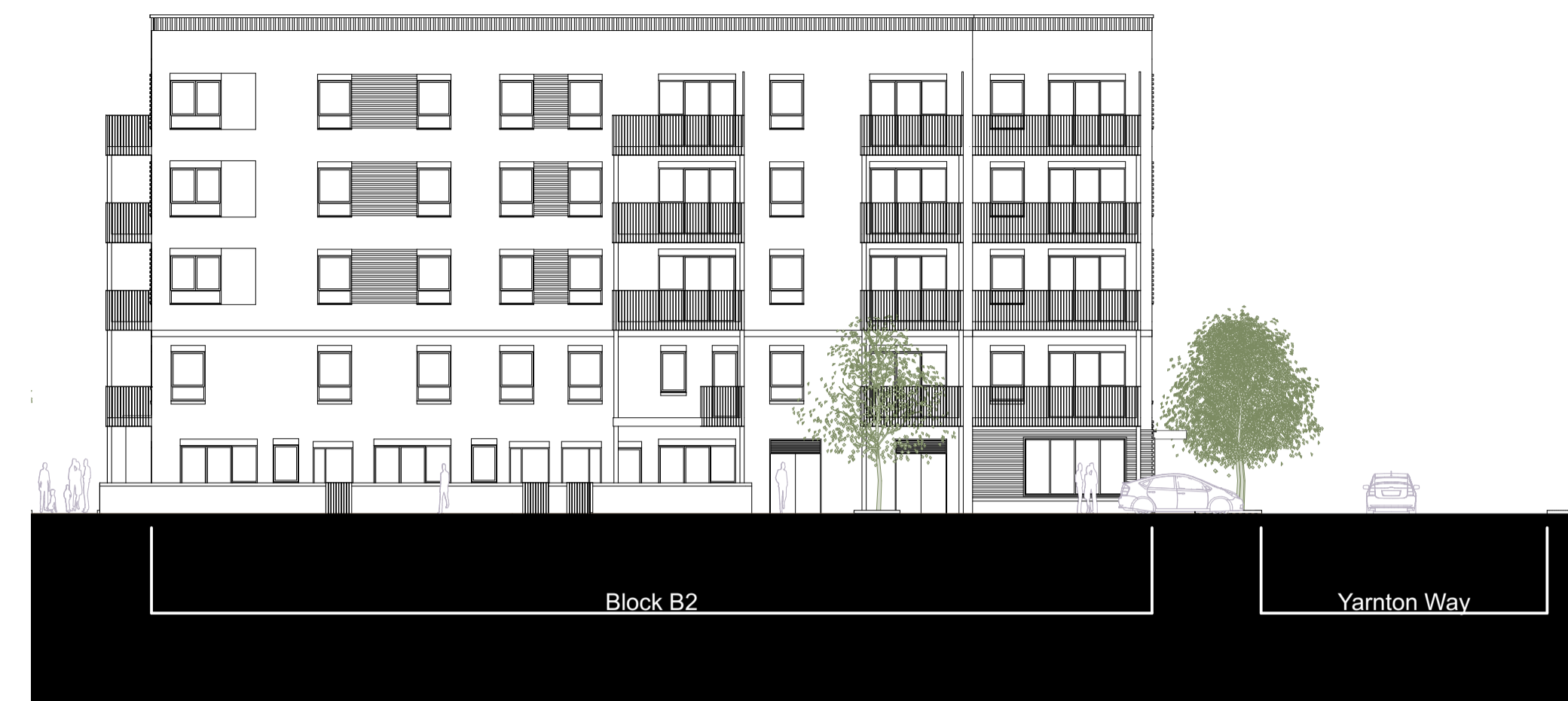
Block B West Elevation 1:200