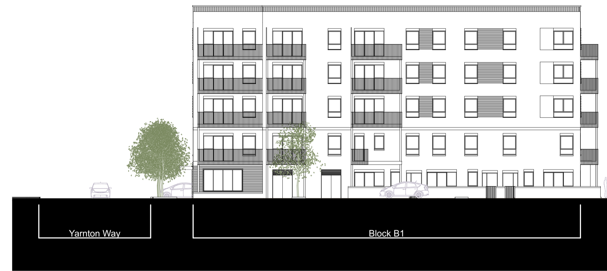
Block B East Elevation 1:200