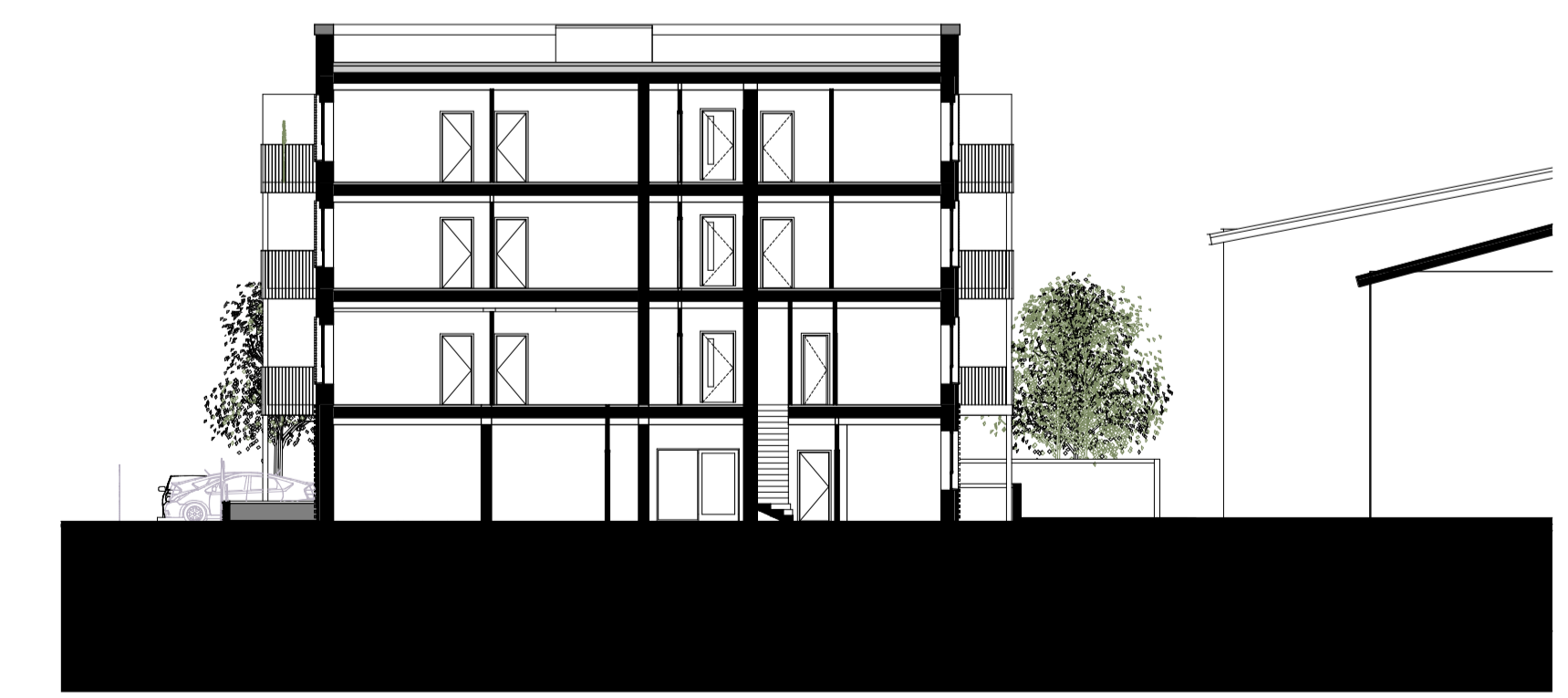
Block A Section bb 1:200