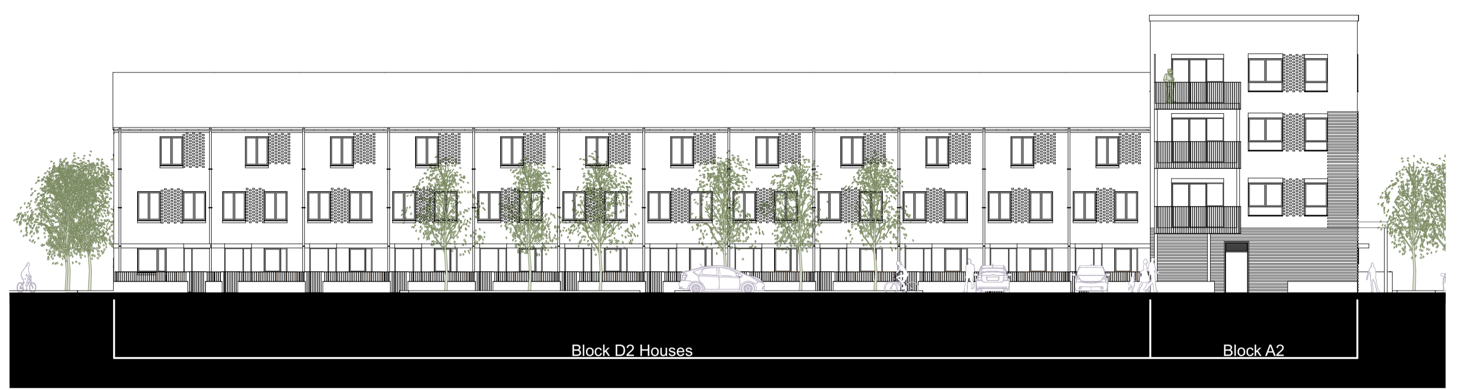
Block A and D Houses North Elevation 1:200