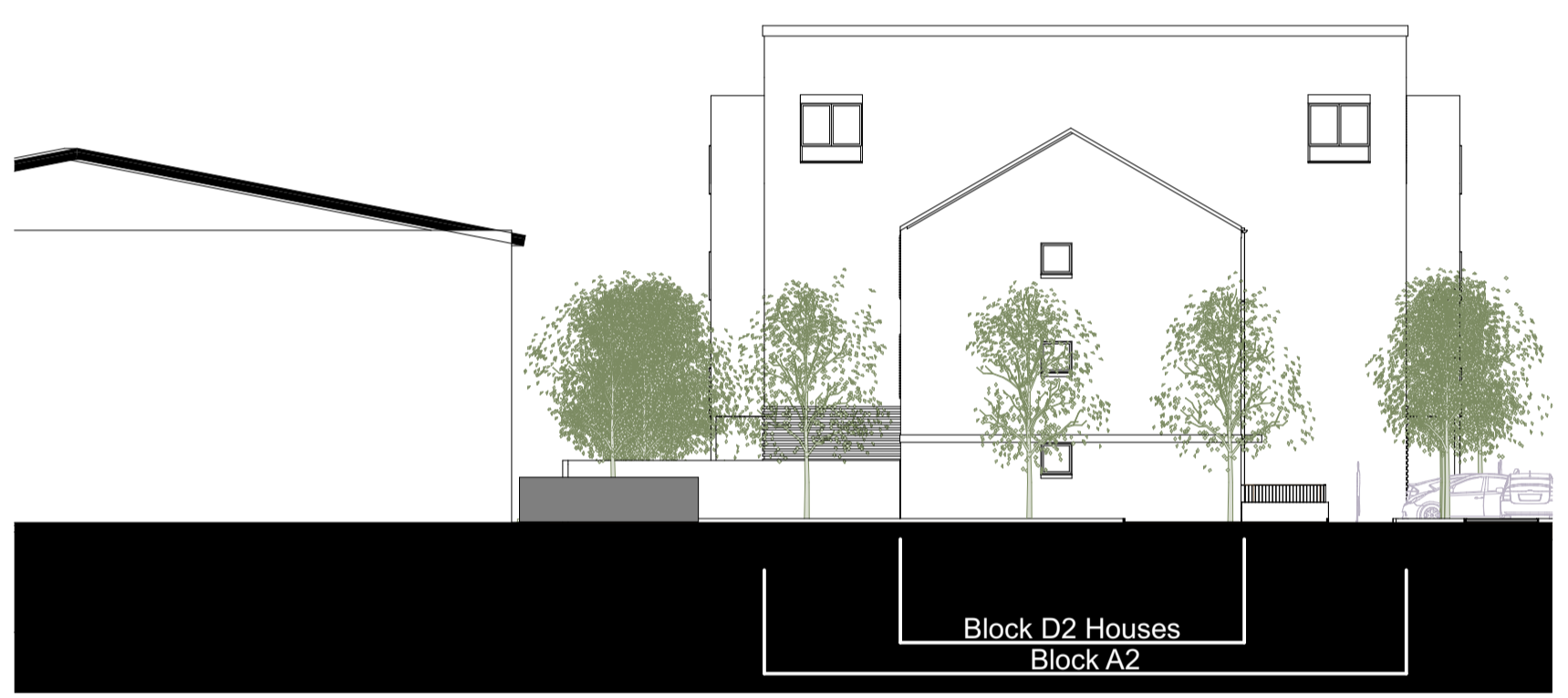
Block A and D Houses East Elevation 1:200