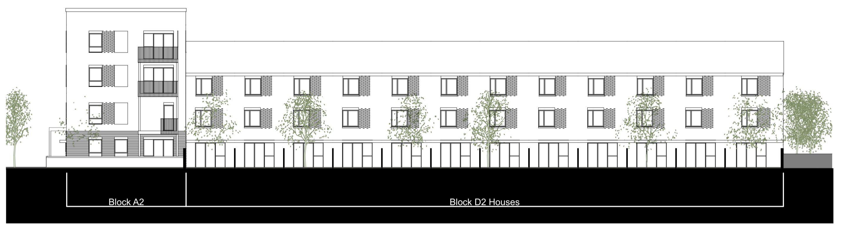
Block A and D Houses South Elevation 1:200