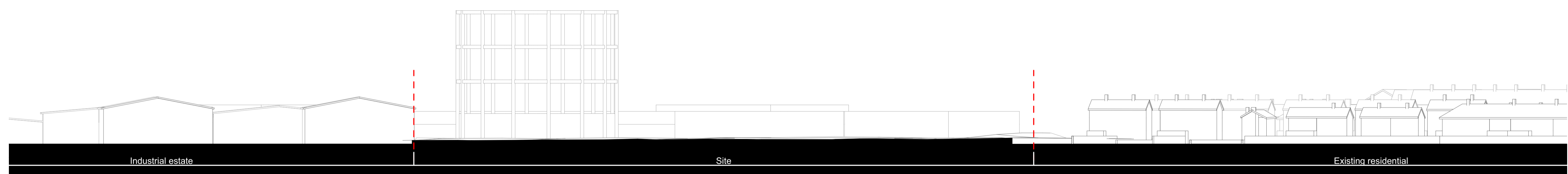
SECTION 03 - SOUTH ELEVATION FACING RAILWAY LINES