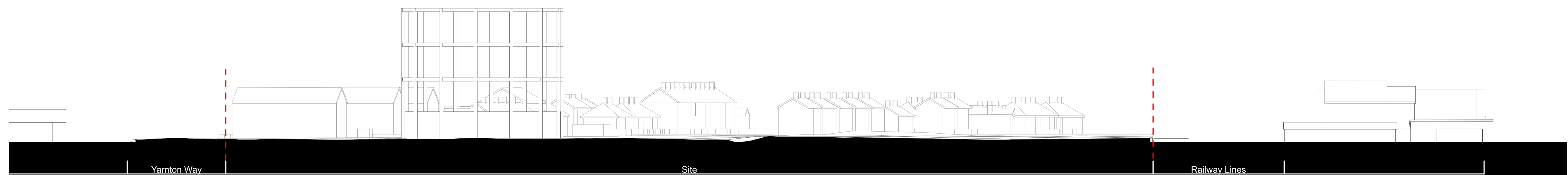
SECTION 04 - West ELEVATION FACING INDUSTRIAL ESTATE