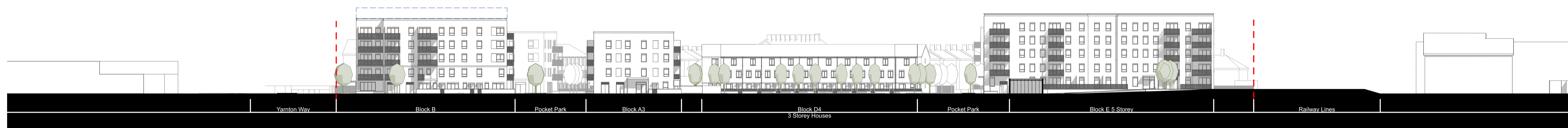
SECTION 05 - SITE SECTION WEST ELEVATION