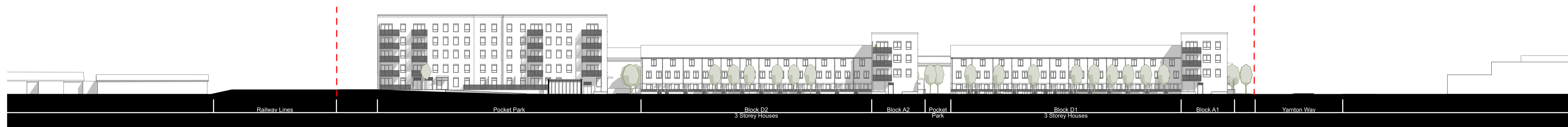
SECTION 06 - SITE SECTION EAST ELEVATION