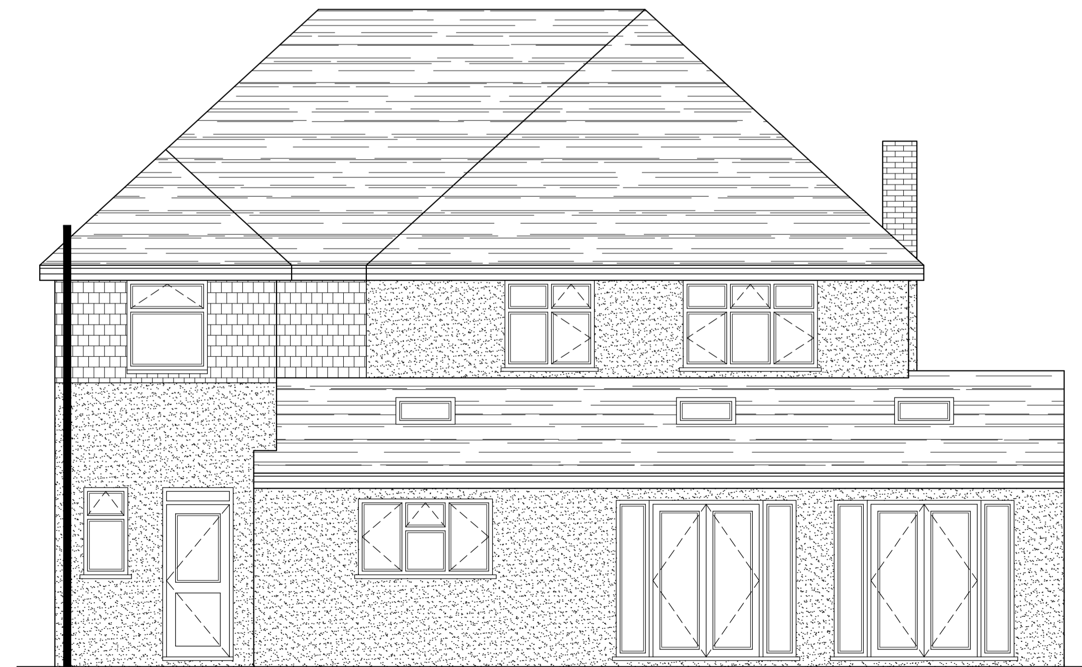
EXISTING REAR ELEVATION SCALE 1:50