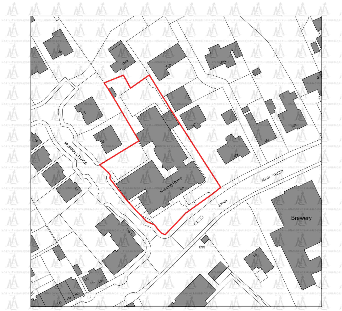
Location Plan, 1:1000

Do not scale from drawing. Use figured dimensions only. All dimensions to be checked on site by the contractor and any discrepancies to be notified to the architect prior to works being carried out. Drawing is copyright of NVDC Architects Ltd.