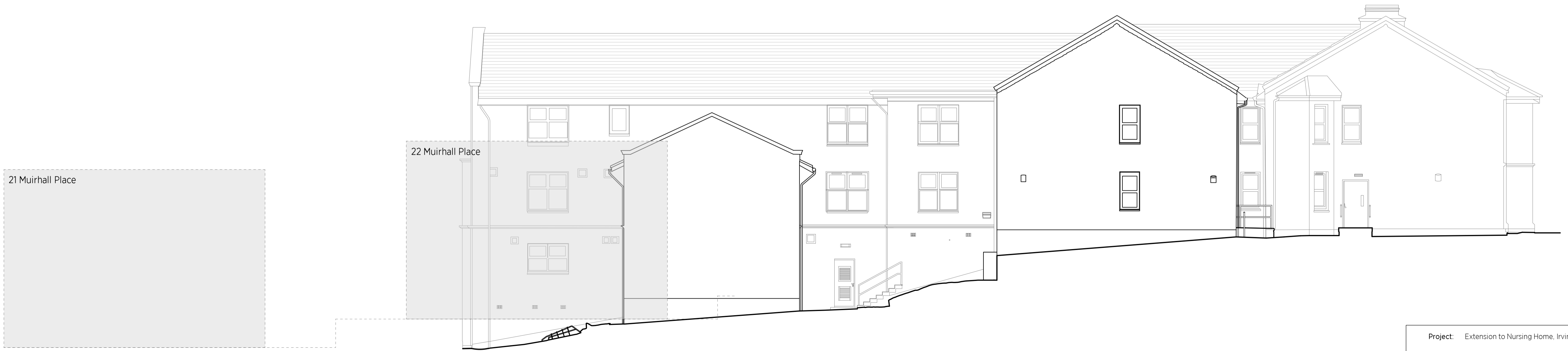
3-3 Existing SW Elevation SCALE 1:100 0 2 3 4 5M