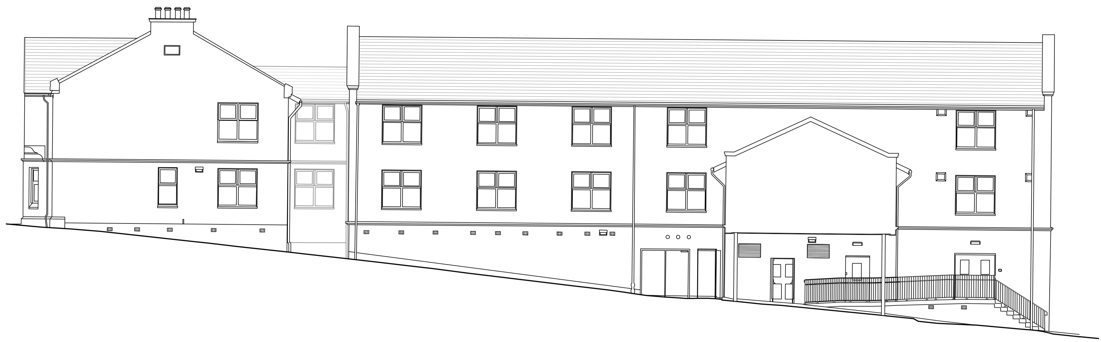
1-1 Existing NE Elevation SCALE 1:100 0 2 3 4 5M