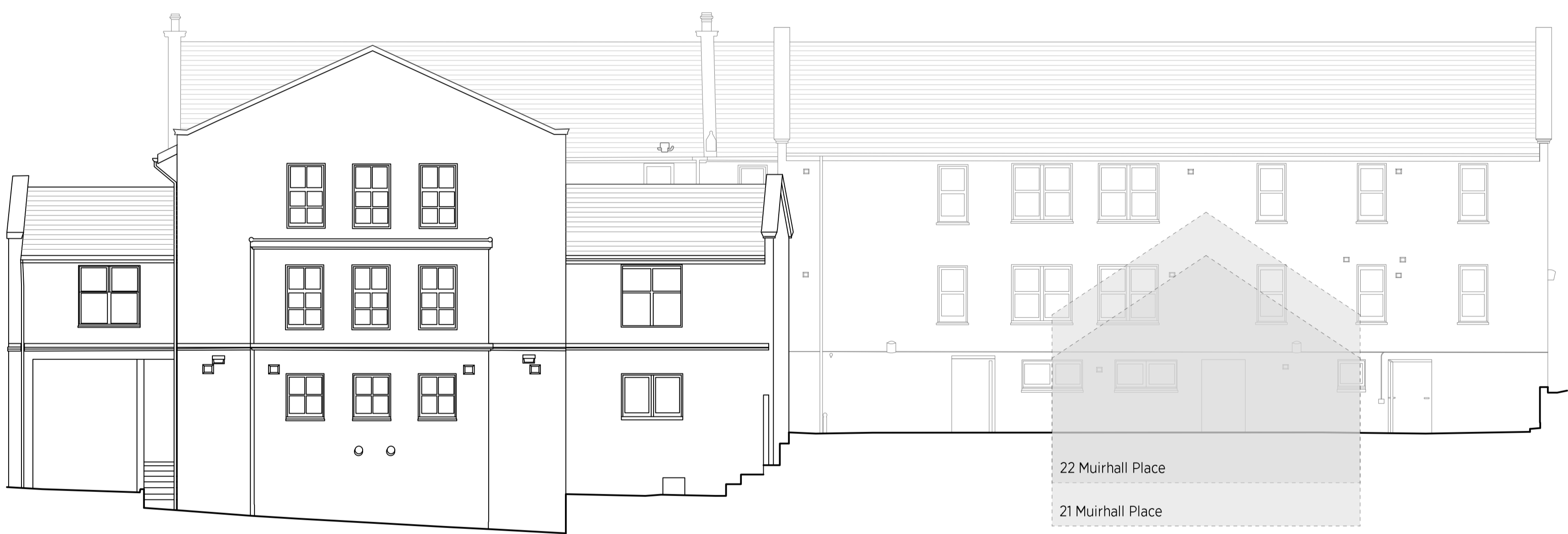
2-2 Existing NW Elevation SCALE 1:100 0 2 3 4 5M