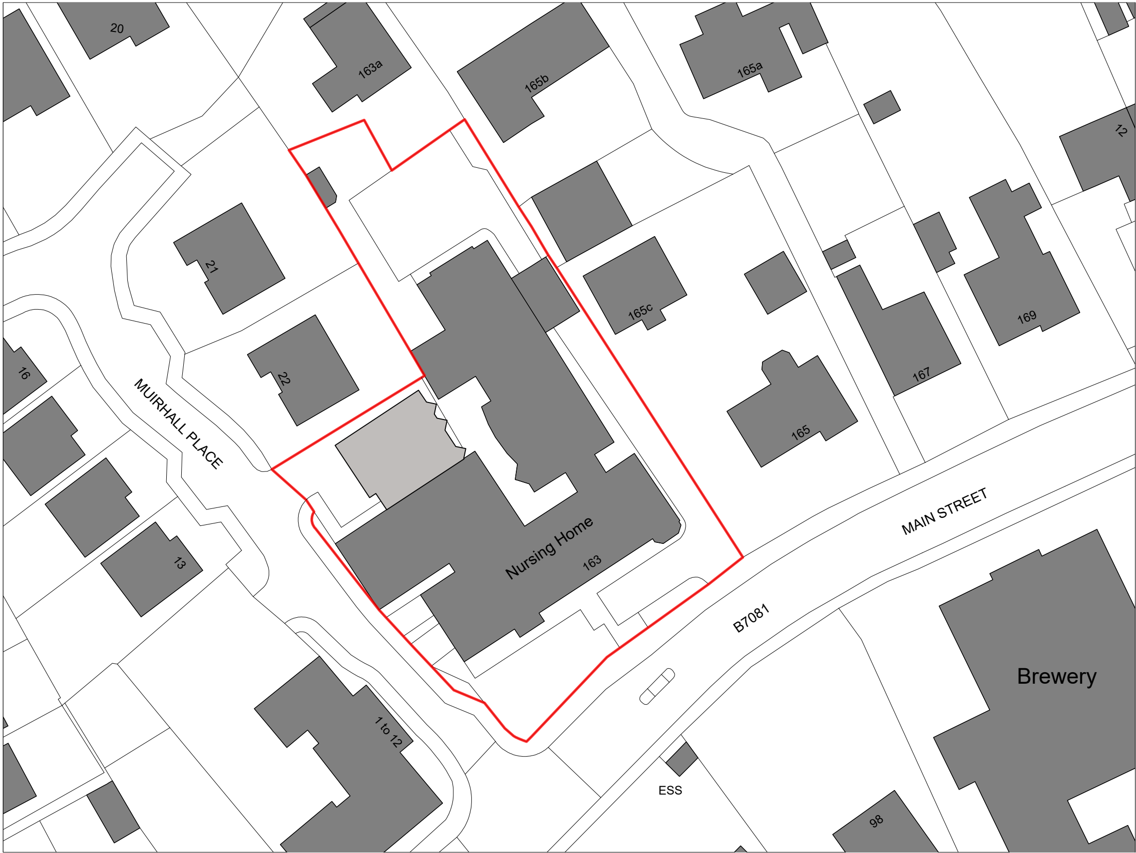
Site Plan, 1:500

Do not scale from drawing. Use figured dimensions only. All dimensions to be checked on site by the contractor and any discrepancies to be notified to the architect prior to works being carried out. Drawing is copyright of NVDC Architects Ltd.