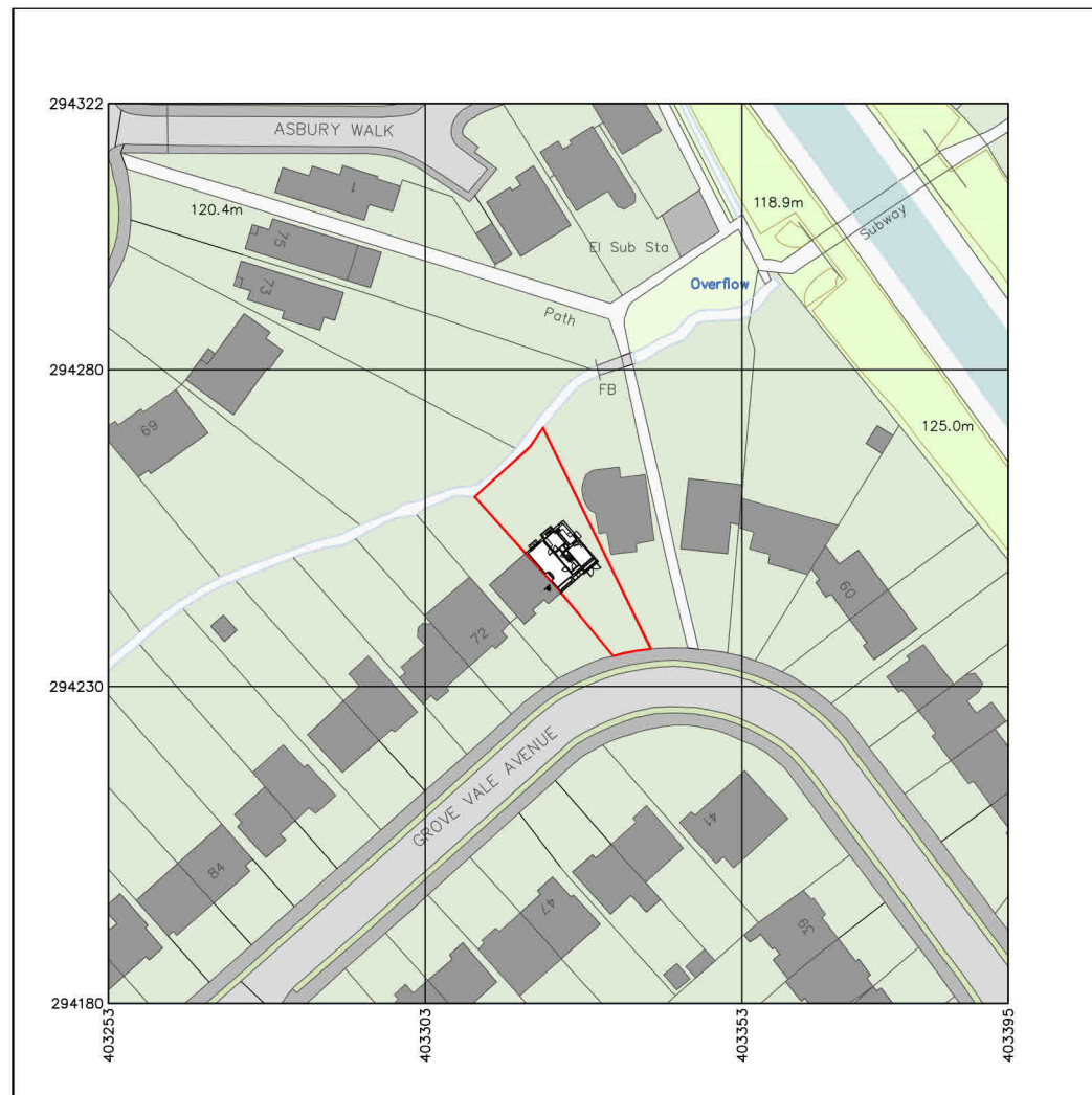
EXISTING LOCATION PLAN