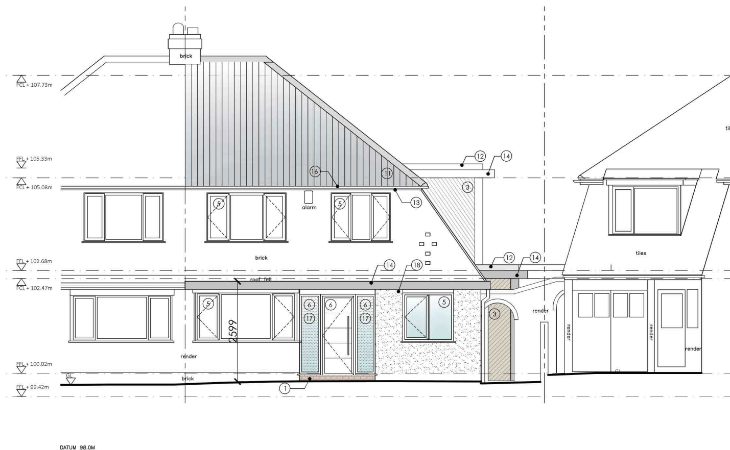
PROPOSED FRONT ELEVATION A