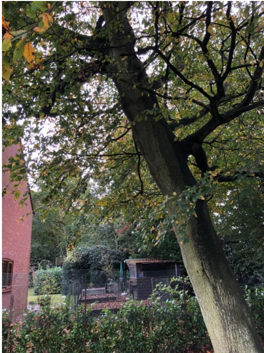
Photo of Beech Tree indicating approximate extent of proposed canopy reduction