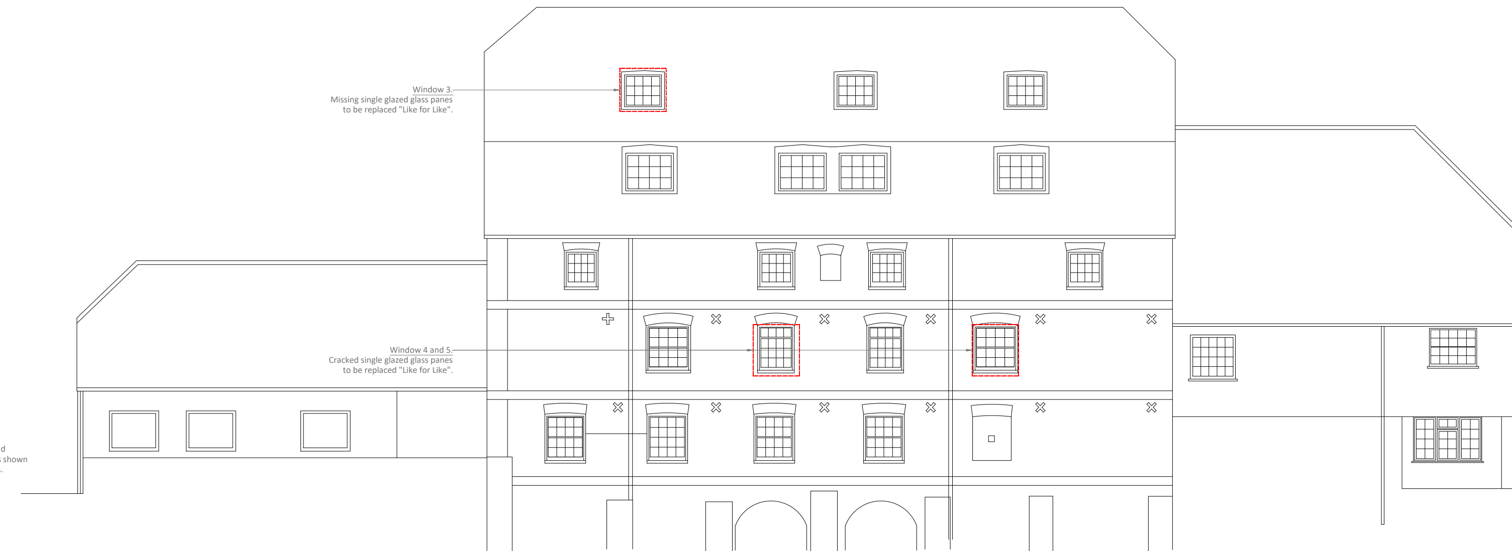
0.00m DATUM EAST ELEVATION