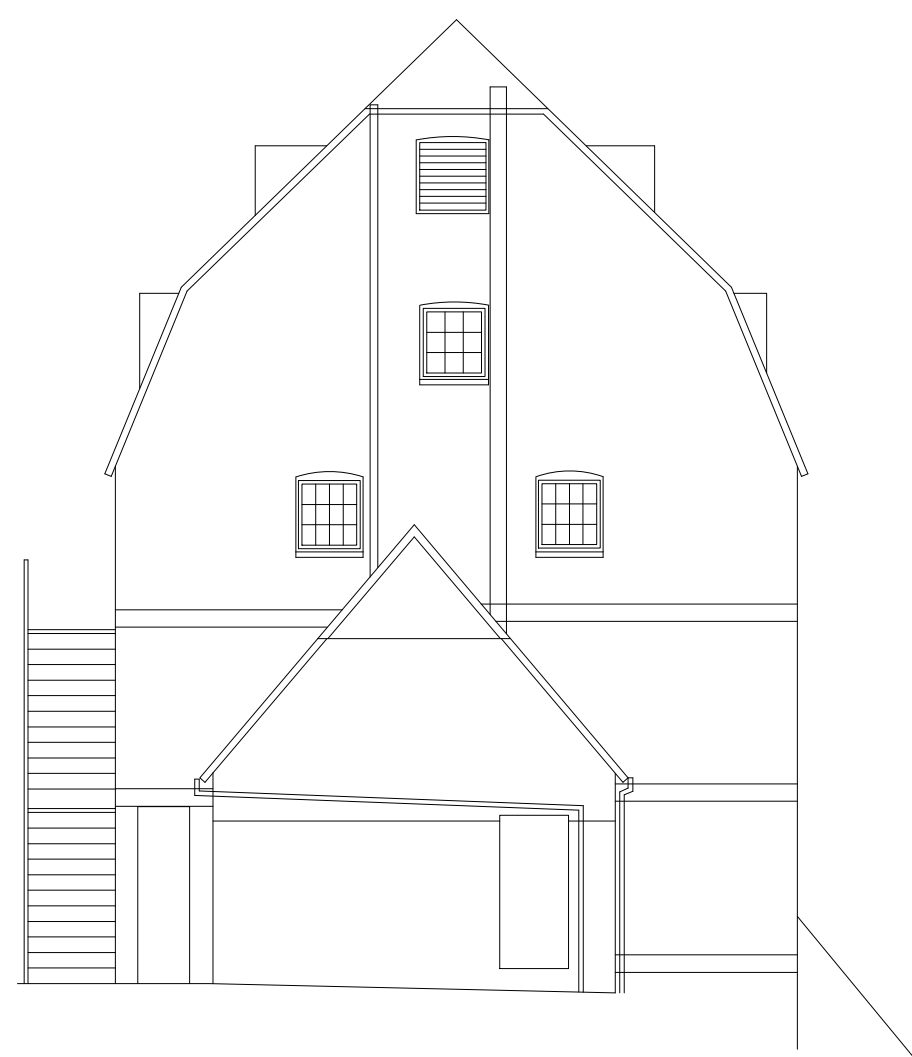
0.00m DATUM SOUTH ELEVATION