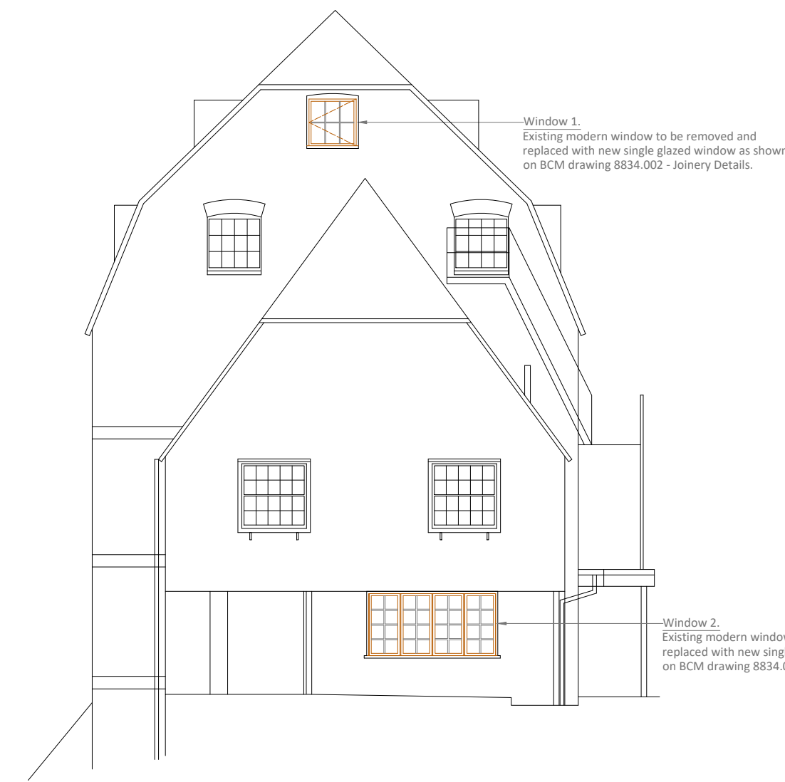
0.00m DATUM NORTH ELEVATION

NOTES: 1. This drawing remains the copyright of BCM 2. All dimensions and levels are to be checked on site prior to works commencing. 3. Do not scale from this drawing: Use figured dimensions only. 4. Any discrepancies found are to be reported to the Project Manager immediately. 5. This drawing is to be read in conjunction with sub-consultants and specialists drawings. 6. CAD File name: 8834.002 Planning Enforcement Drawings.dwg 7. If BCM logo is not in colour this is not an original drawing