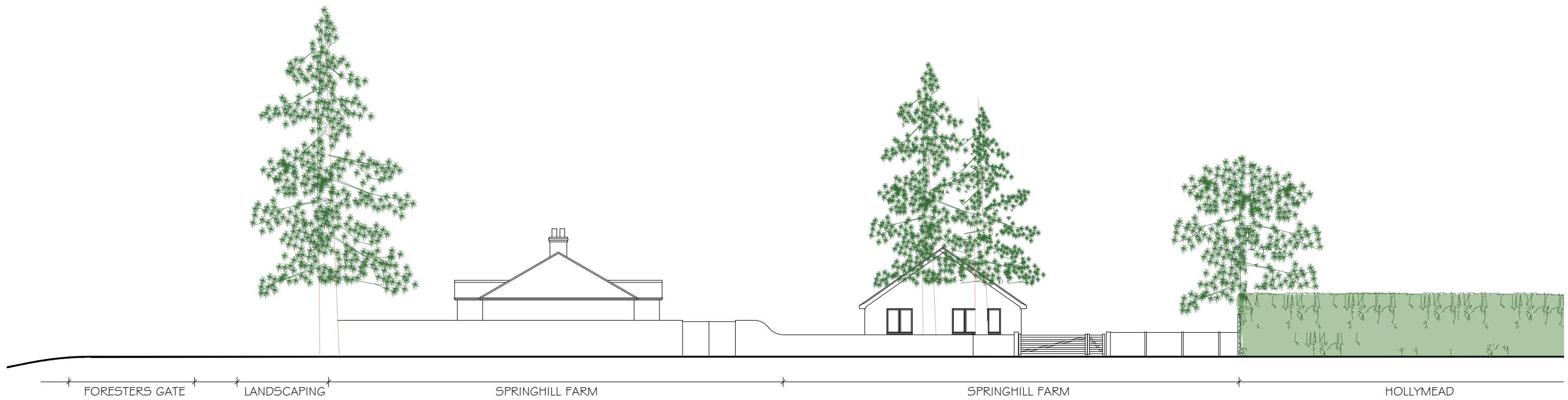
EXISTING STREET SCENE 1:200