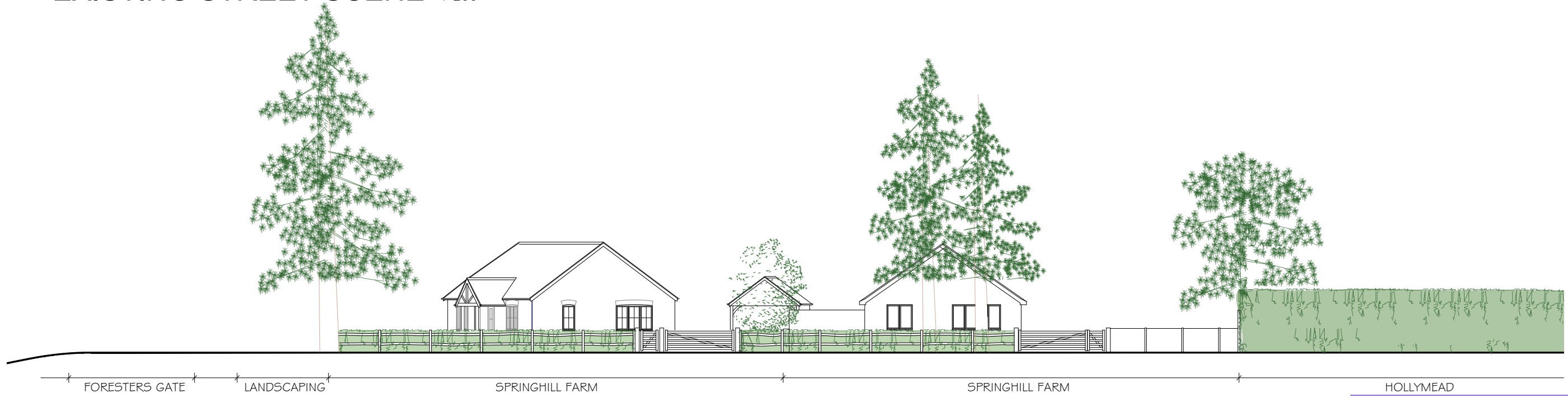
PROPOSED STREET SCENE 1:200