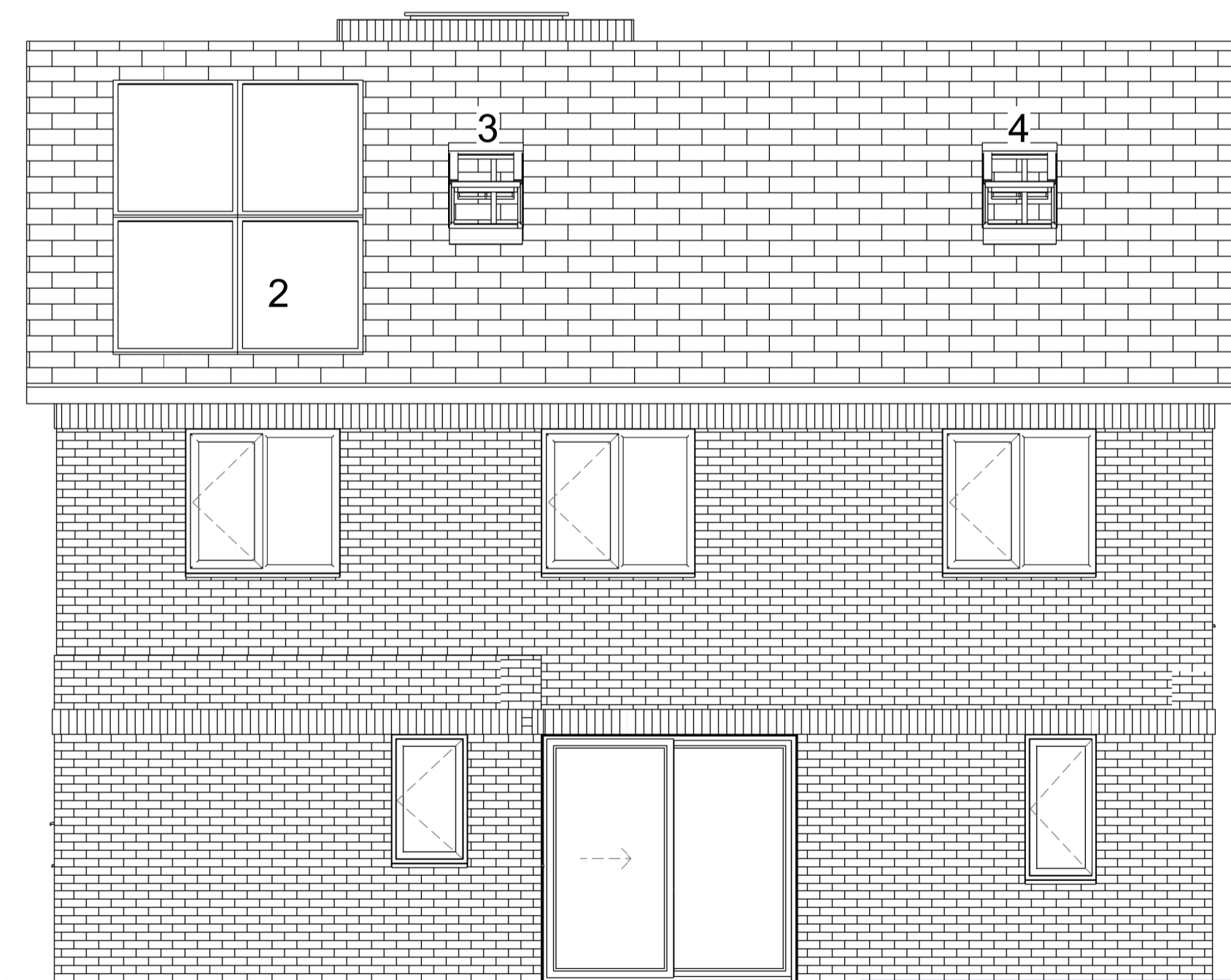
3 Dwelling C - East Elevation 1 : 50