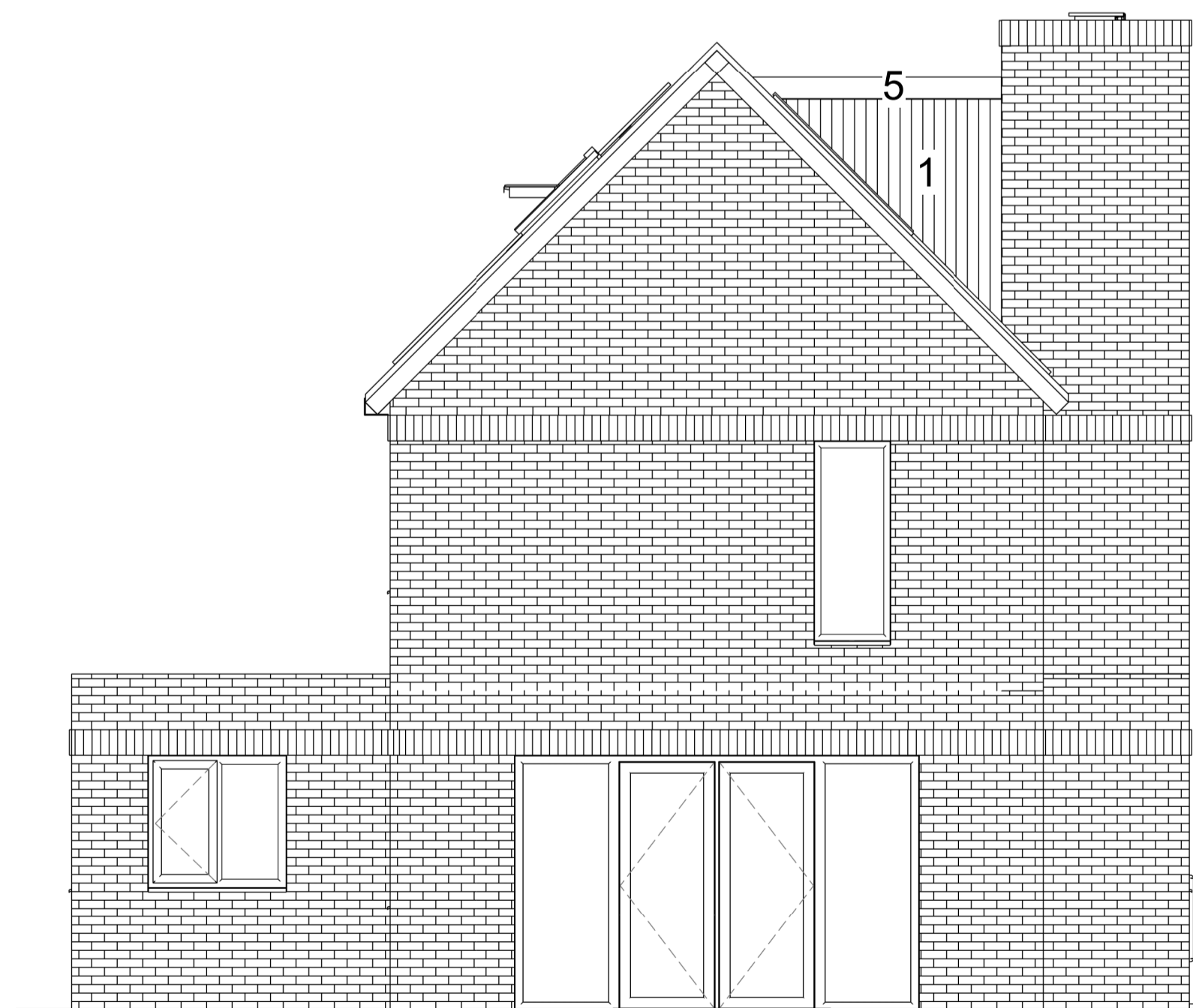
4 Dwelling C - North Elevation 1 : 50