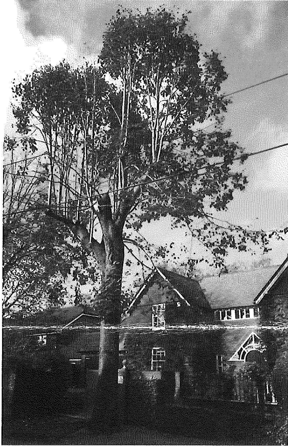
Lime tree 1416 showing the tall vertical branches.