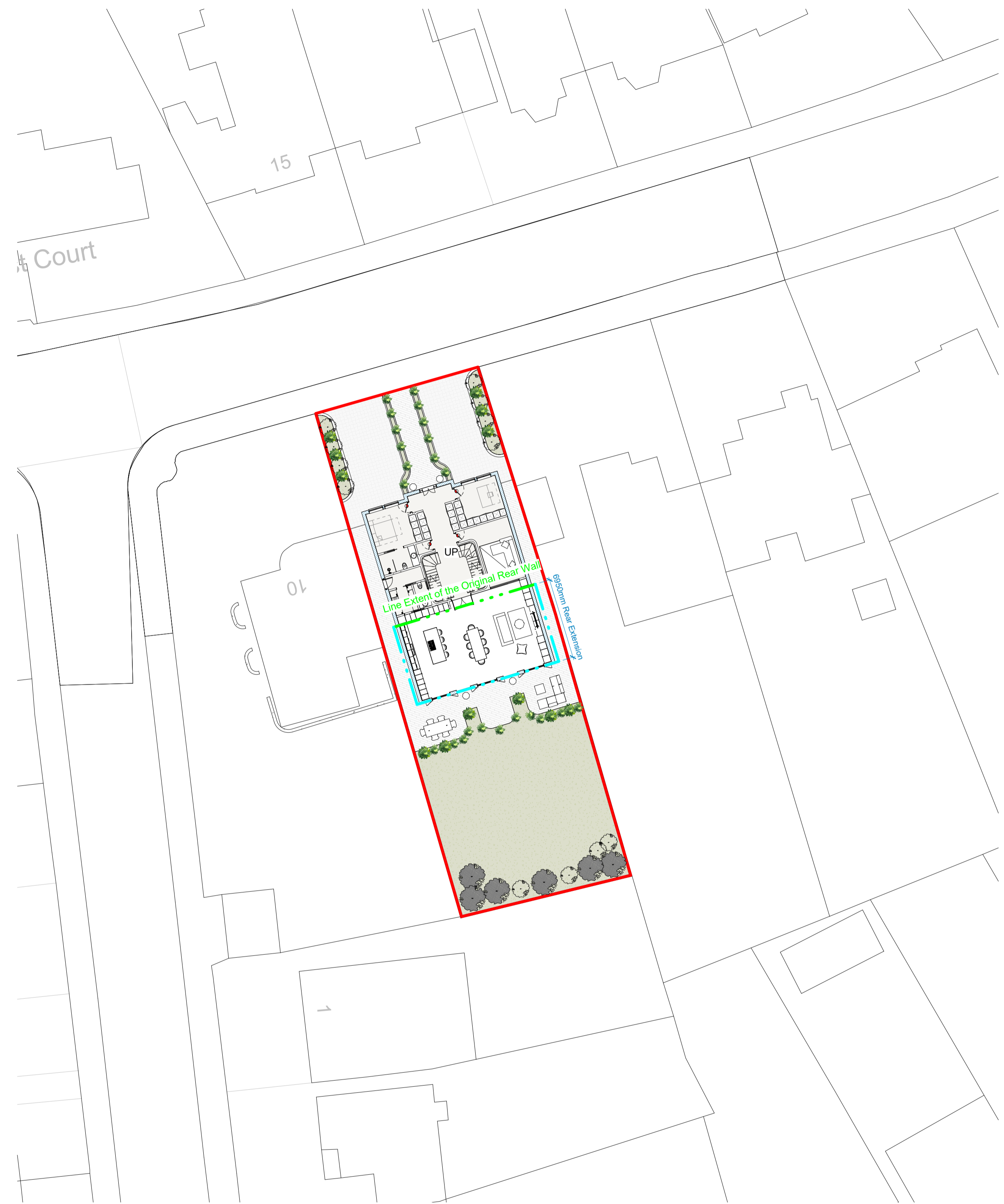
2 SP - Proposed Property Footprint 1:250