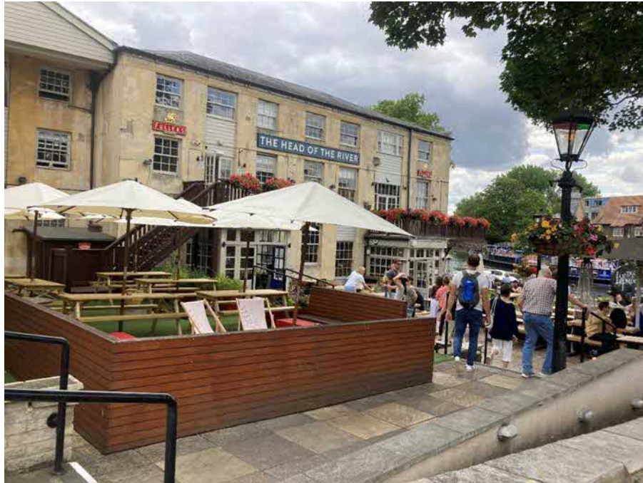
Above – Front beer garden of Head of the River public house