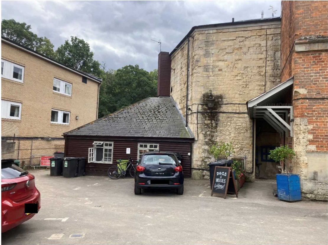
Above – Existing rear elevation of extended building and university halls of residence to left (east) of site, and original Wharf House to right (north) of site