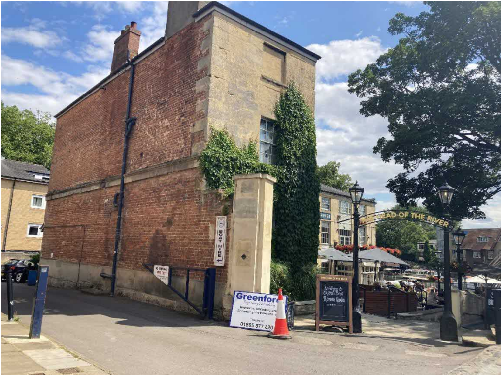
Above – Rear elevation of original Wharf House building and access to the public house from the private access side road which bounds the site to the north