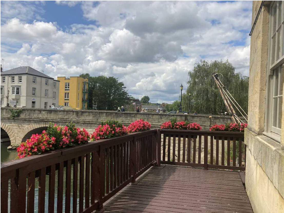
Above – Existing balcony on river side elevation