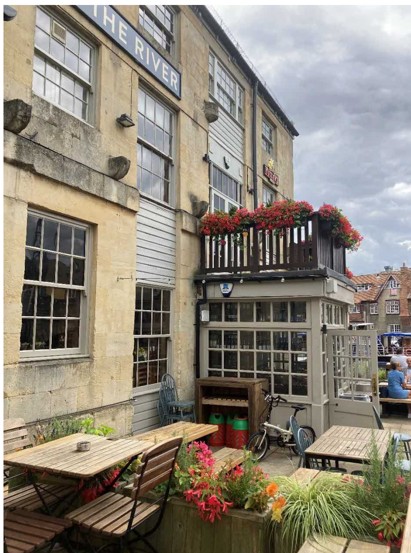
Above – Existing balcony on the front elevation looking south towards the river