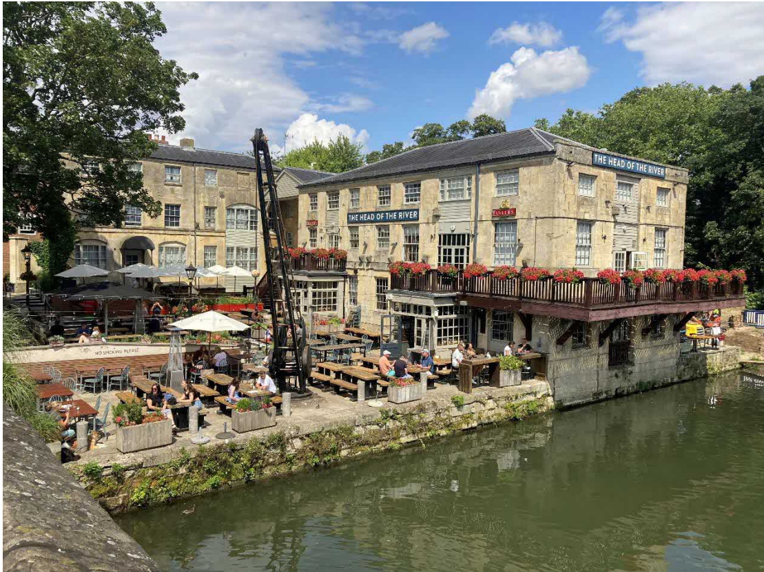
Above – Front and south elevation of existing buildings and adjacent crane