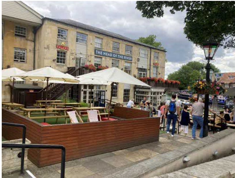
Above – existing balconies and staircases on the front elevation facing the beer garden