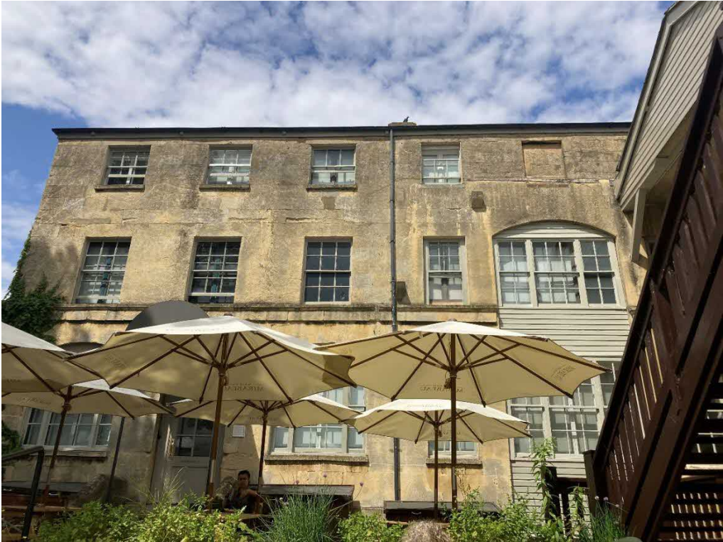
Above – Front elevation of existing Wharf House building and existing beer garden