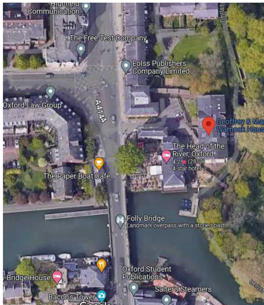
Above – Google Earth Image of the site