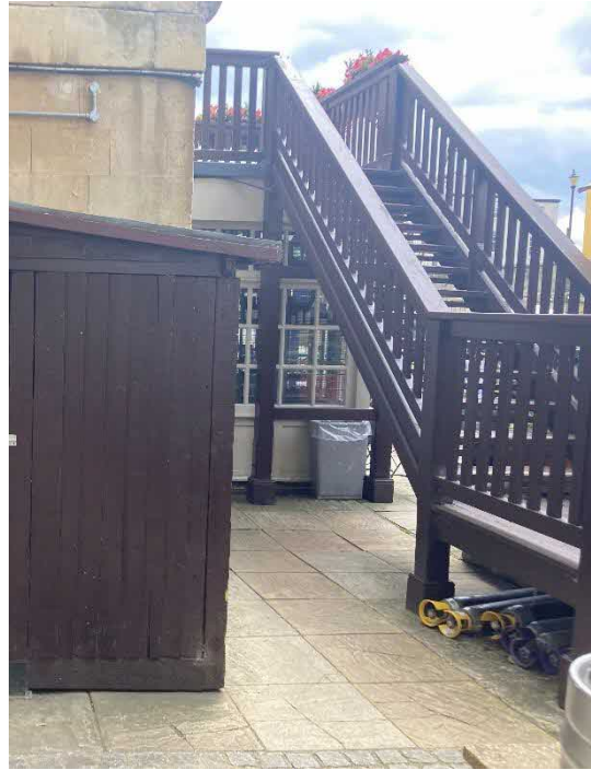
Above – Existing staircase on the front elevation and photo taken looking south towards the river