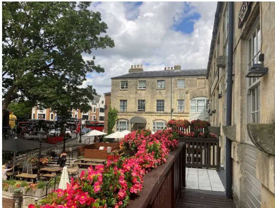
Above – Existing balcony on the front elevation looking north towards stairway and Wharf House