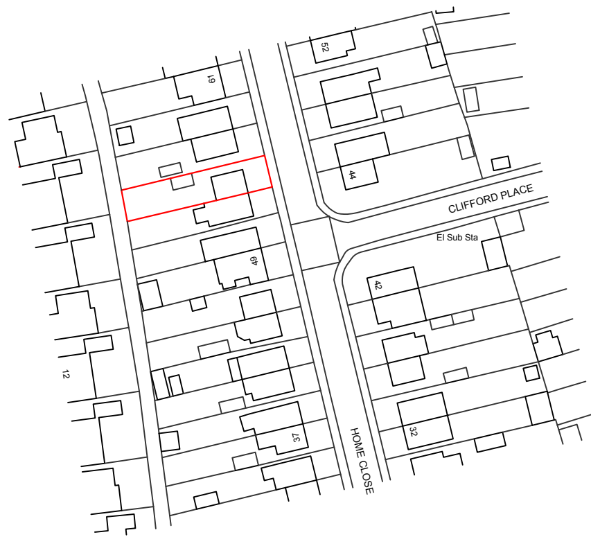
PROPOSED LOCATION PLAN 1:1250 AT A3