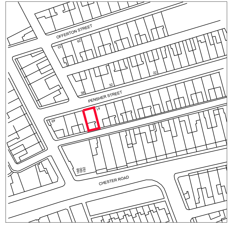
EXISTING SITE LOCATION PLAN 1:1250