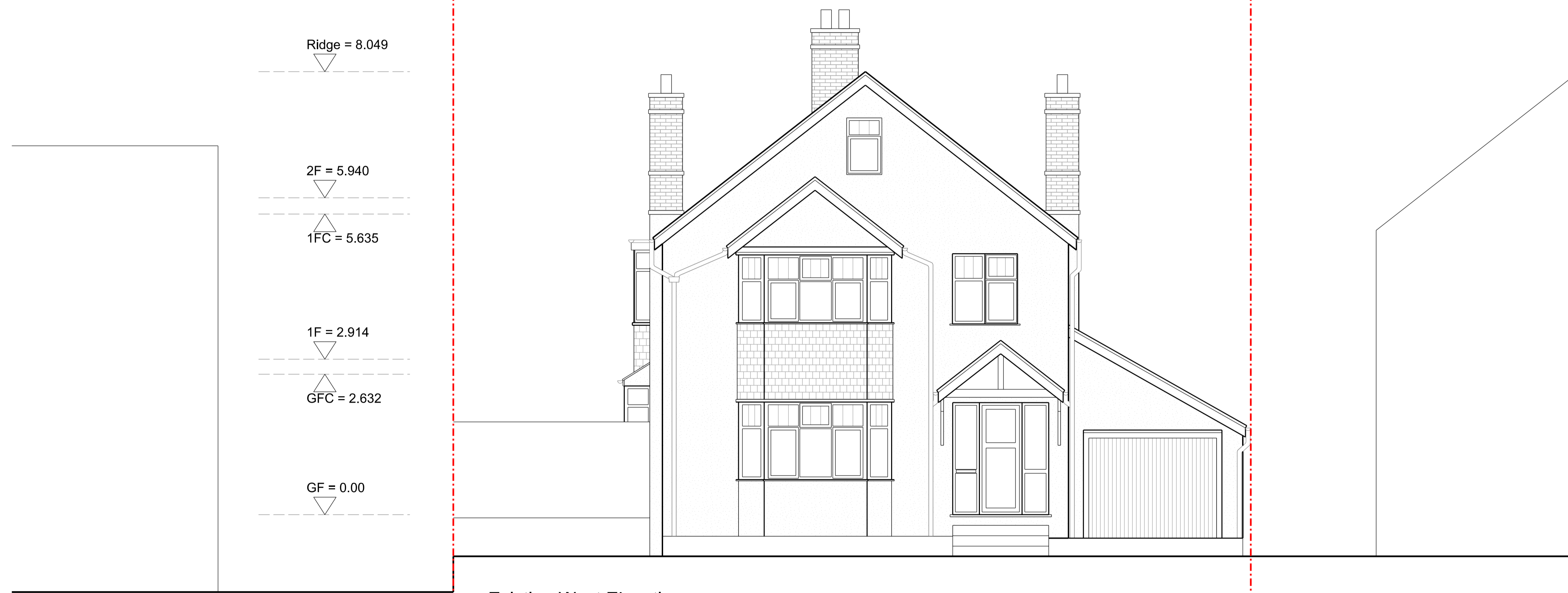
Existing West Elevation