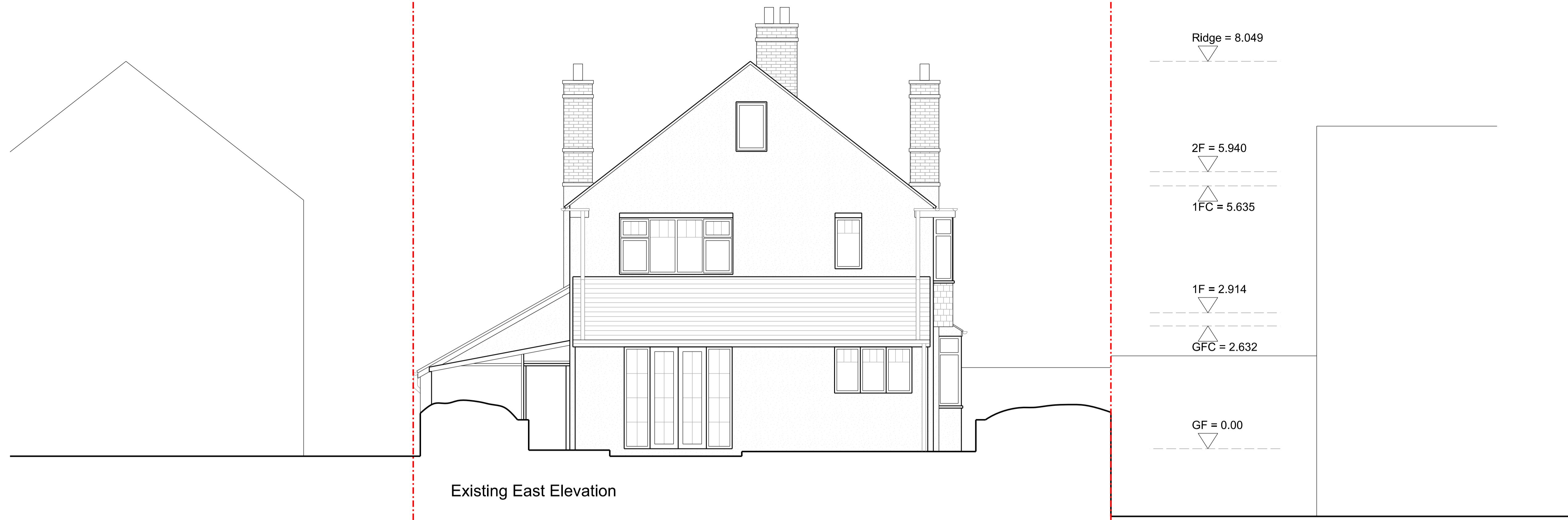
Existing East Elevation