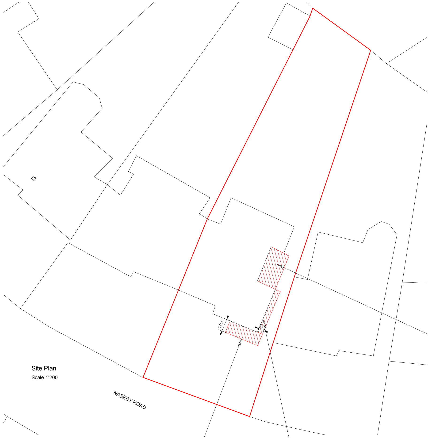
Site Plan Scale 1:200