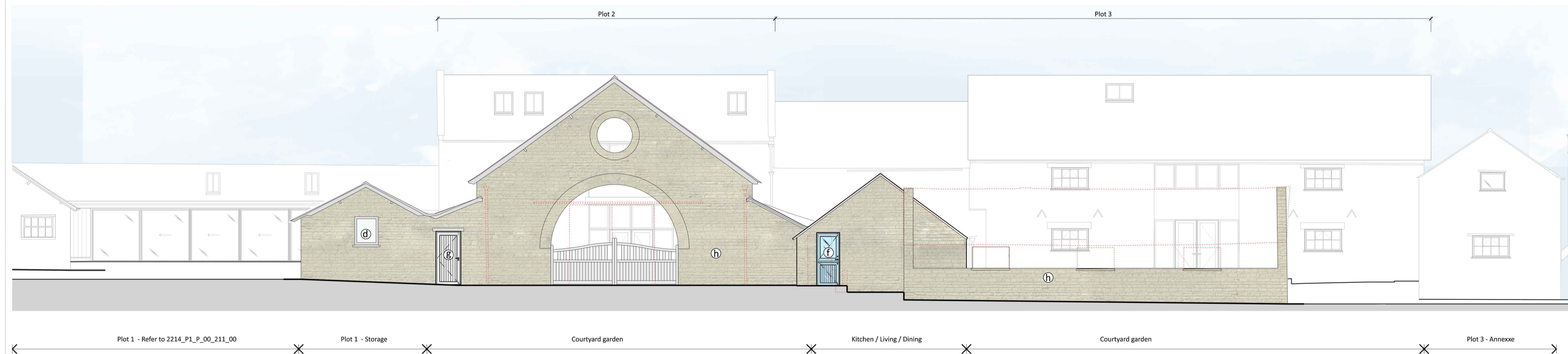
02 South Elevation 2214_P_00_200_1.dgn