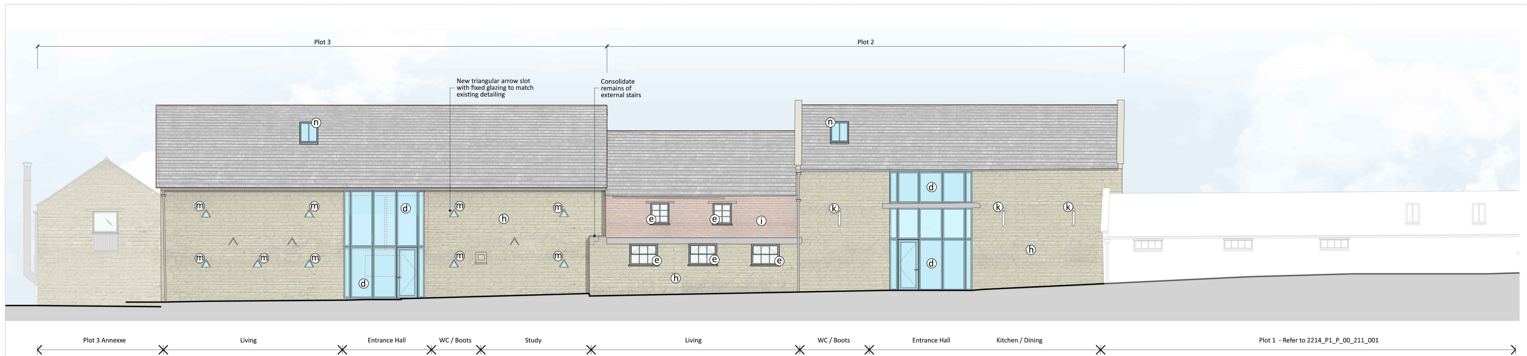
01 North Elevation 2214_P_00_200_1.dgn