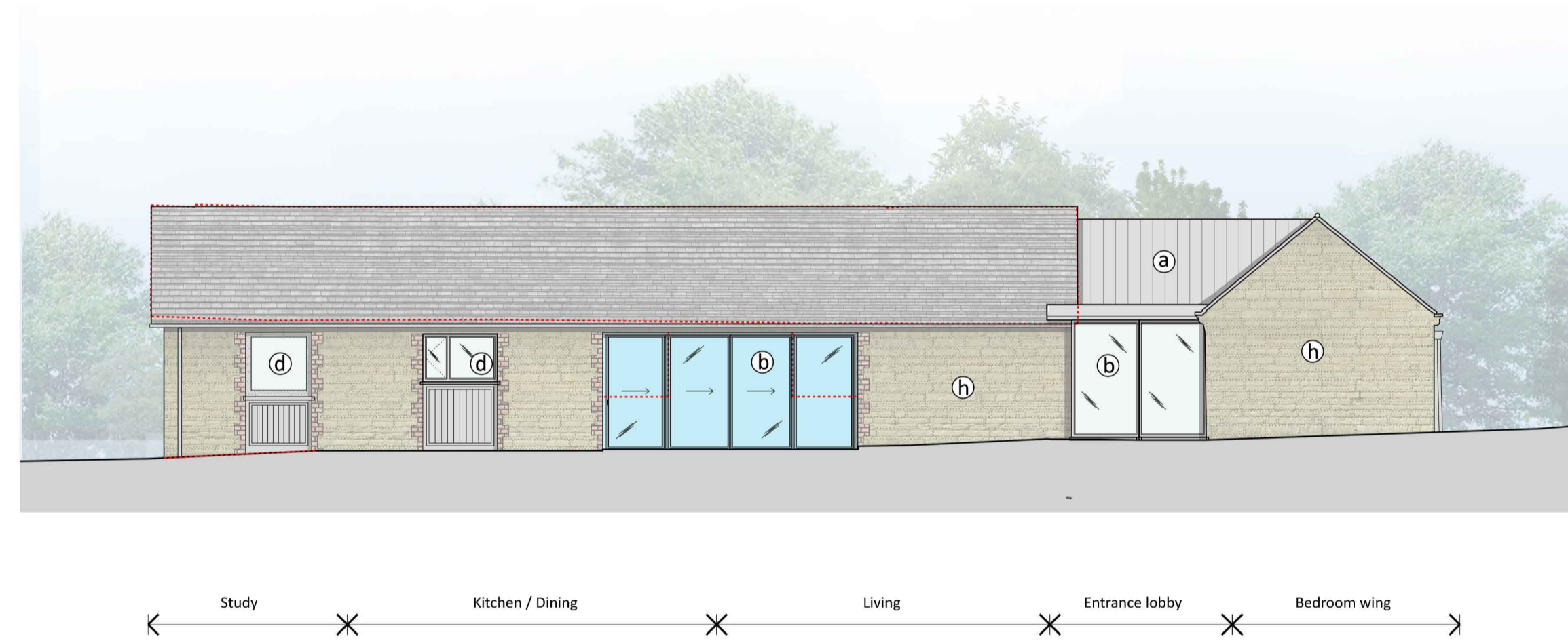
02 East Elevation 2214_P1_P_00_220_1.dgn