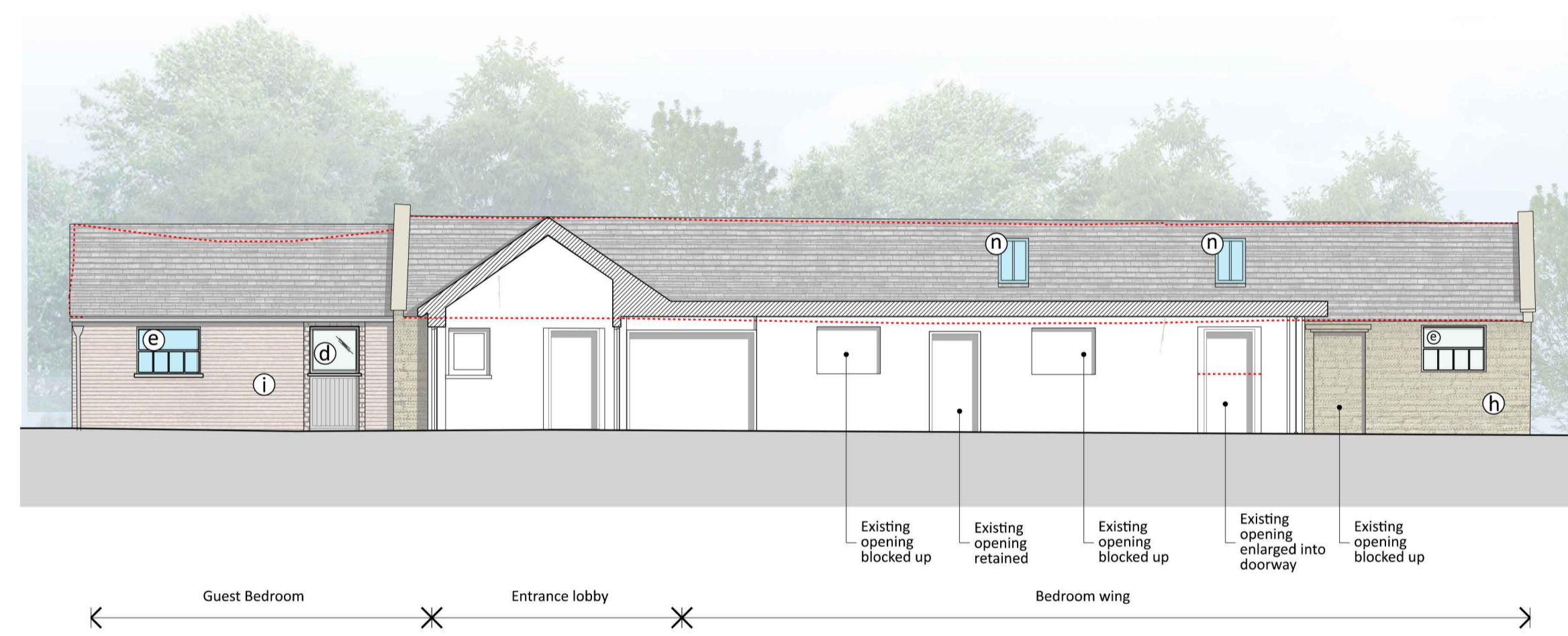
03 South Elevation Section 2214_P1_P_00_220_1.dgn