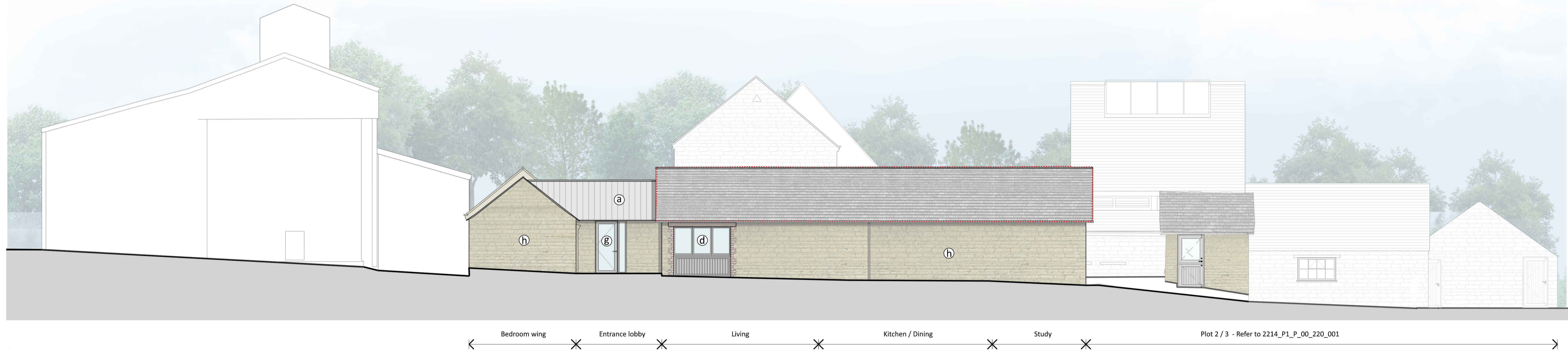
01 West Elevation 2214_P1_P_00_220_1.dgn