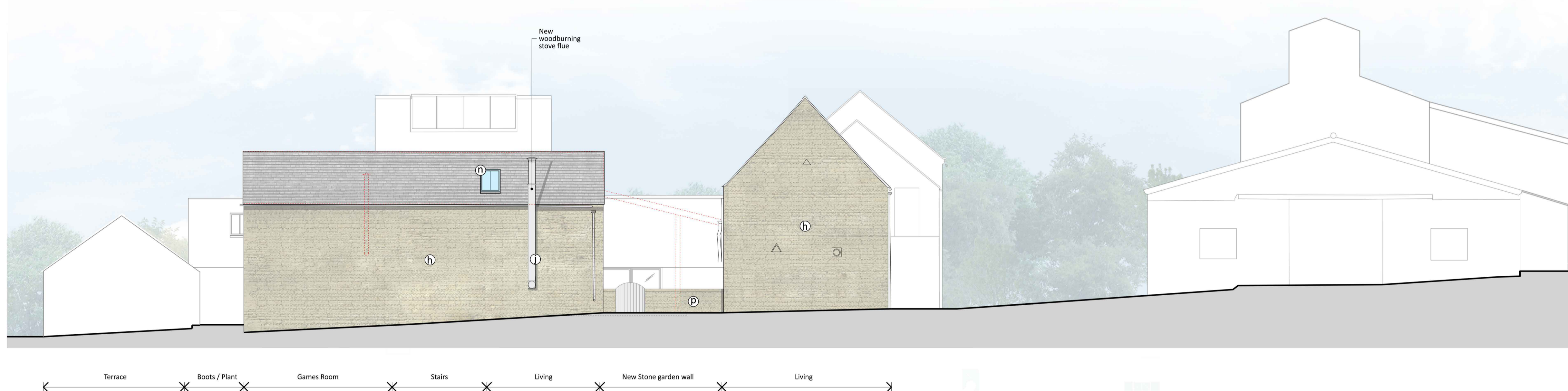
02 East Elevation