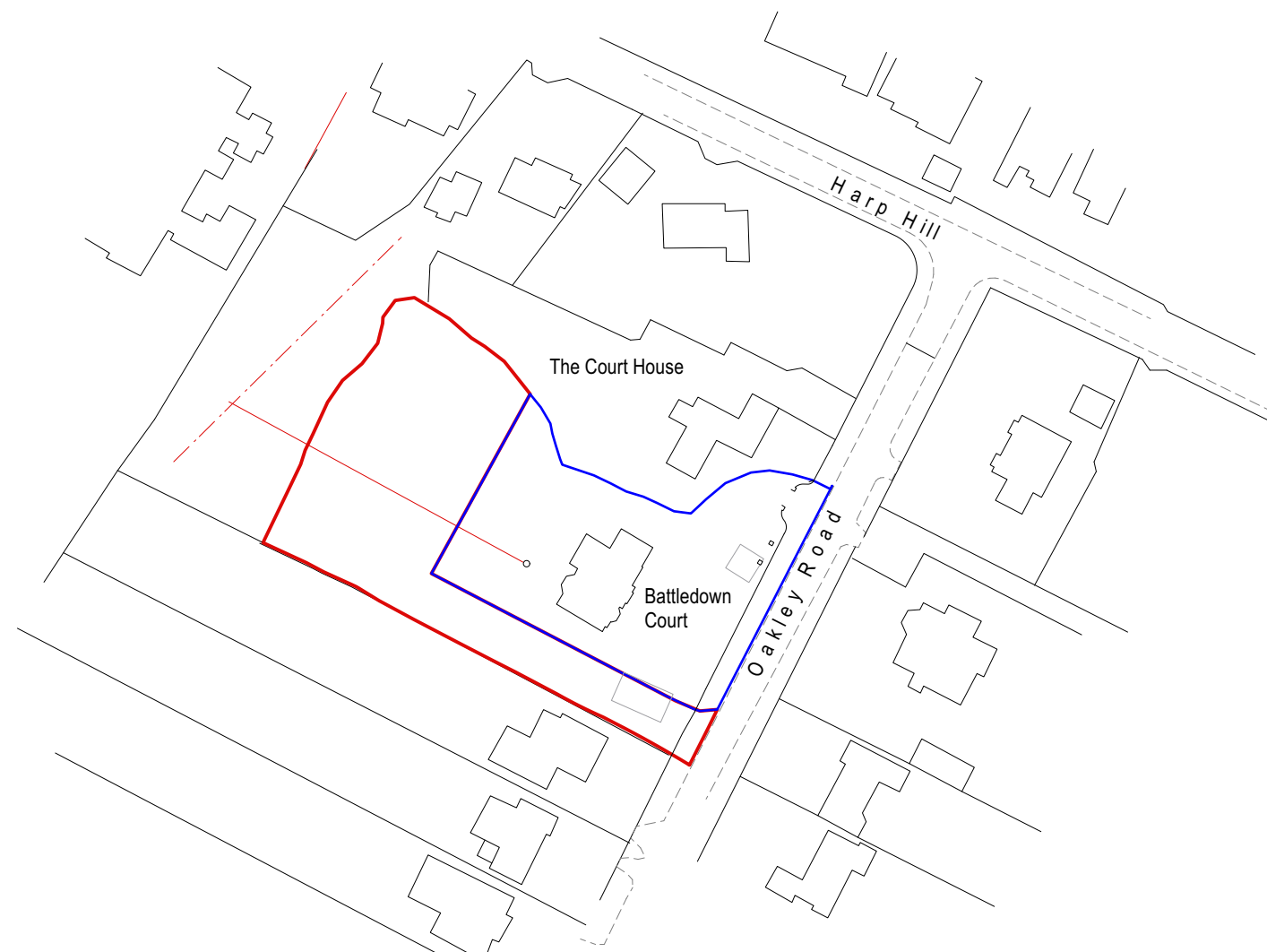
Site Location Plan 1 : 1250 @ A3