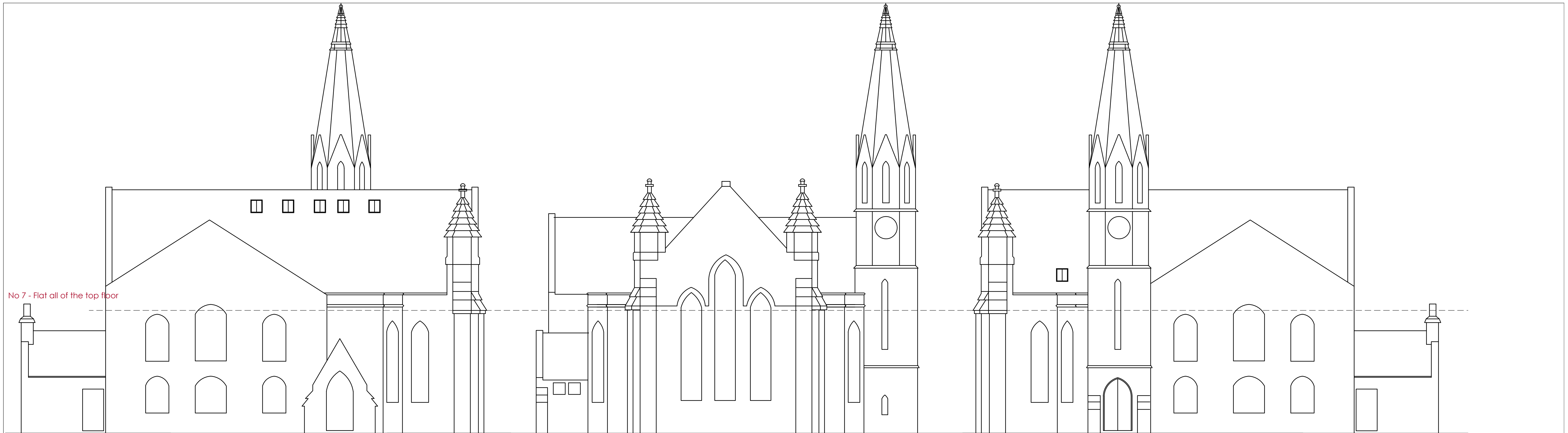
Cluniebank Gardens - South elevation Scale 1 : 100