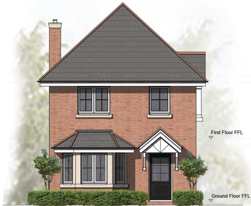
Front Elevation Plot 1