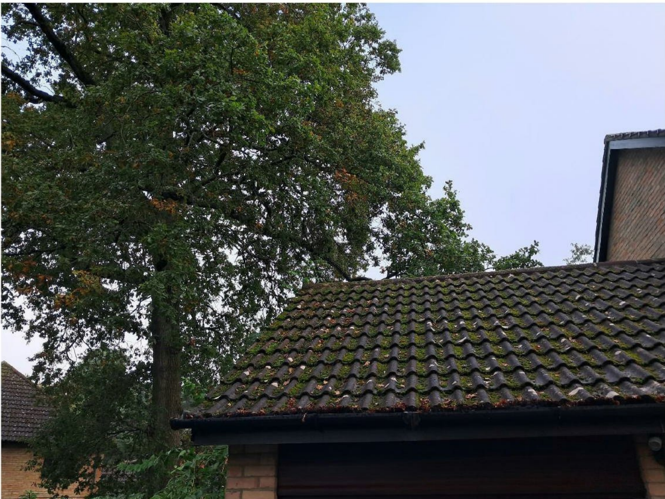
Photo 2 – Alternative view of branches from tree touching garage roof of 18 Byron Drive