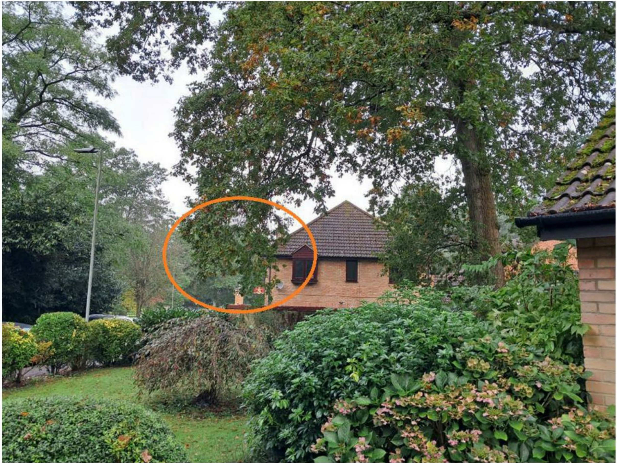
Photo 3 – Pendulous low branch hangs 1.5m above ground level over garden of 18 Byron Close