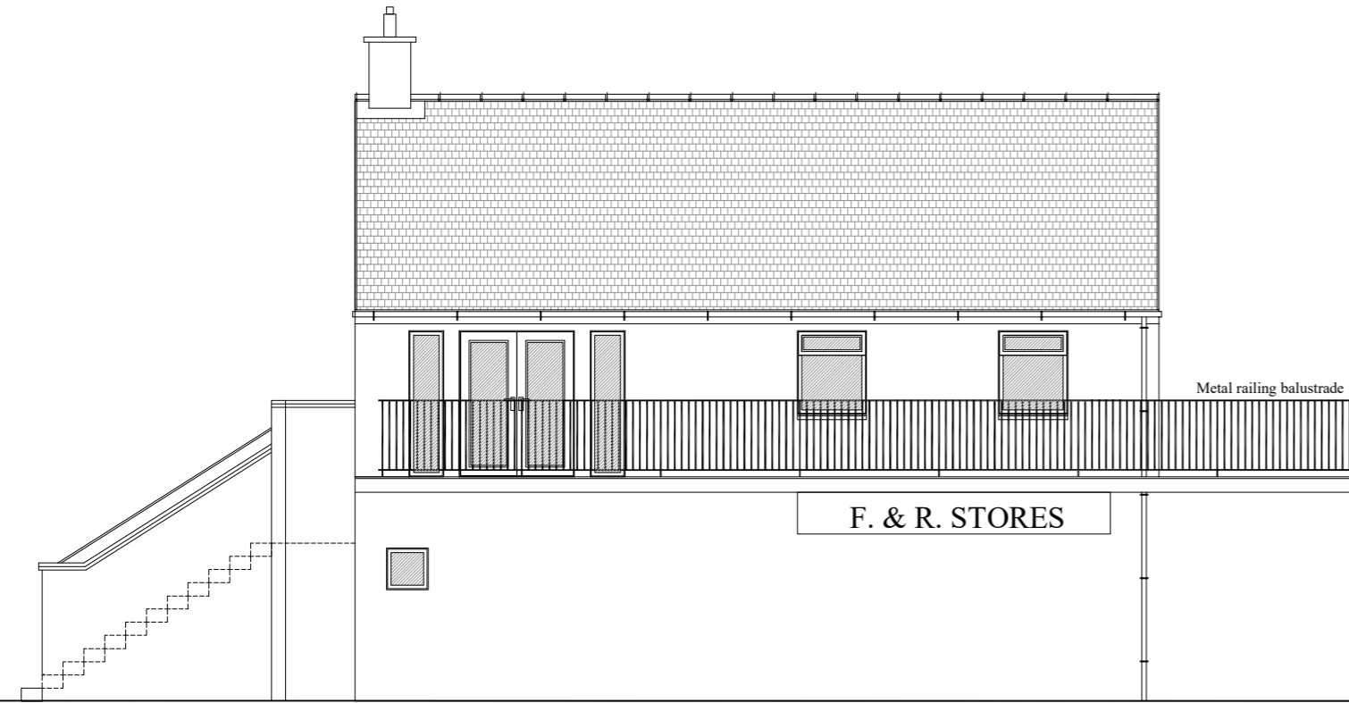
EXISTING & PROPOSED FRONT ELEVATION