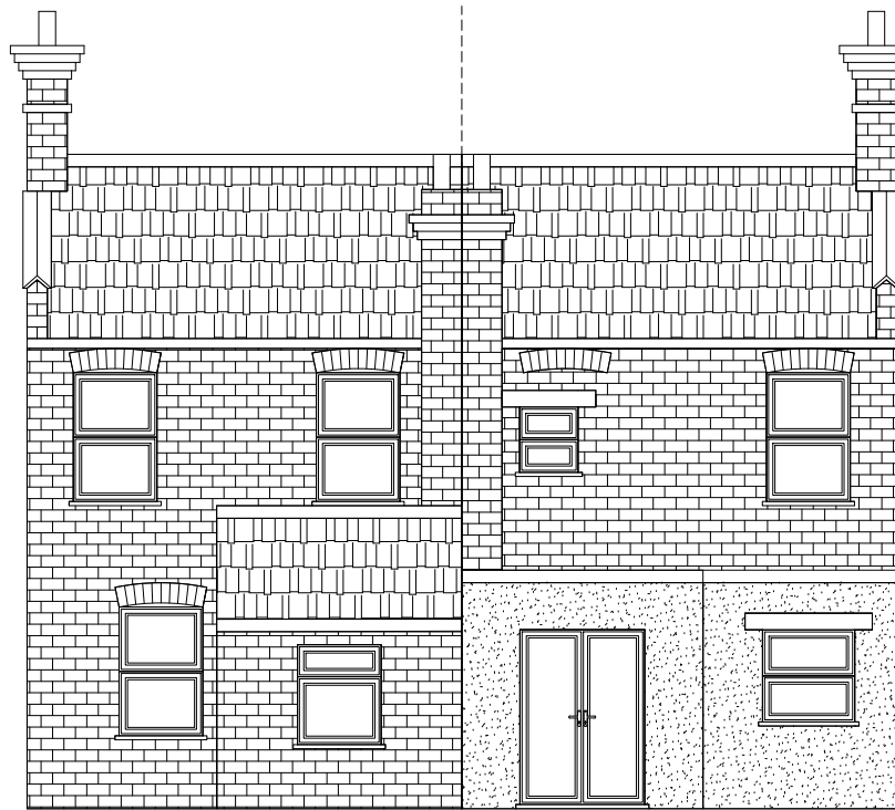
Rear Elevation 3 Southchurch Road